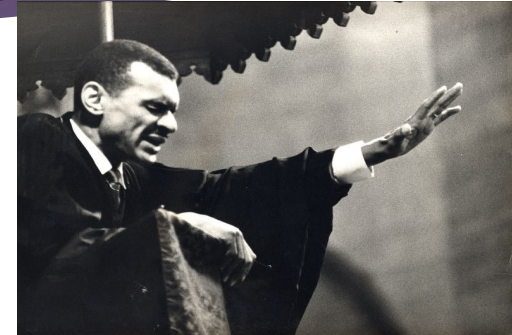
Rev. C.T. Vivian- Founder of Upward Bound