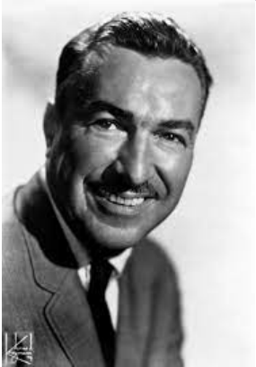
Congressman Adam Clayton Powell