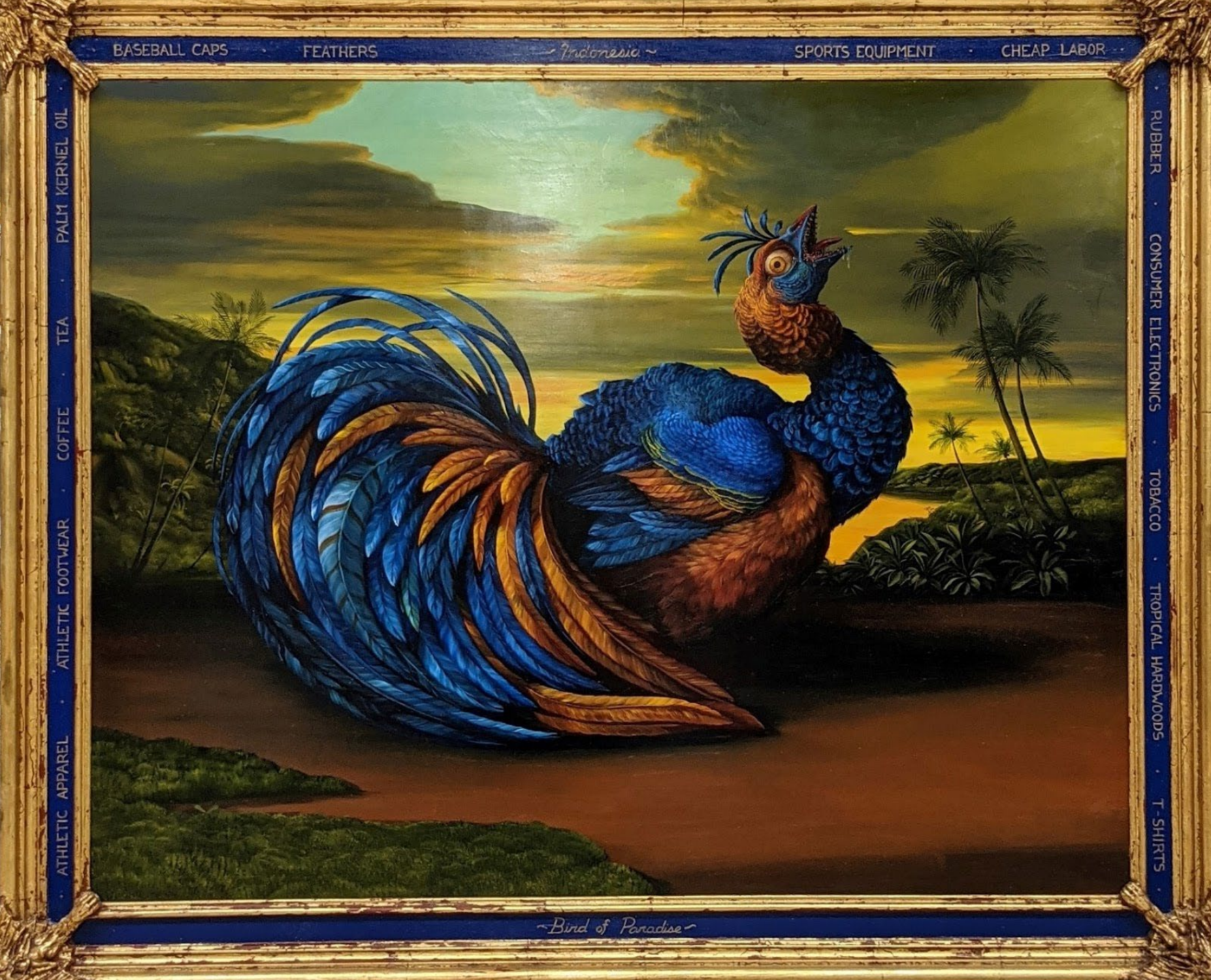
Laurie Hogin, b. 1963 Imperial Eyes: Indonesia, 1997