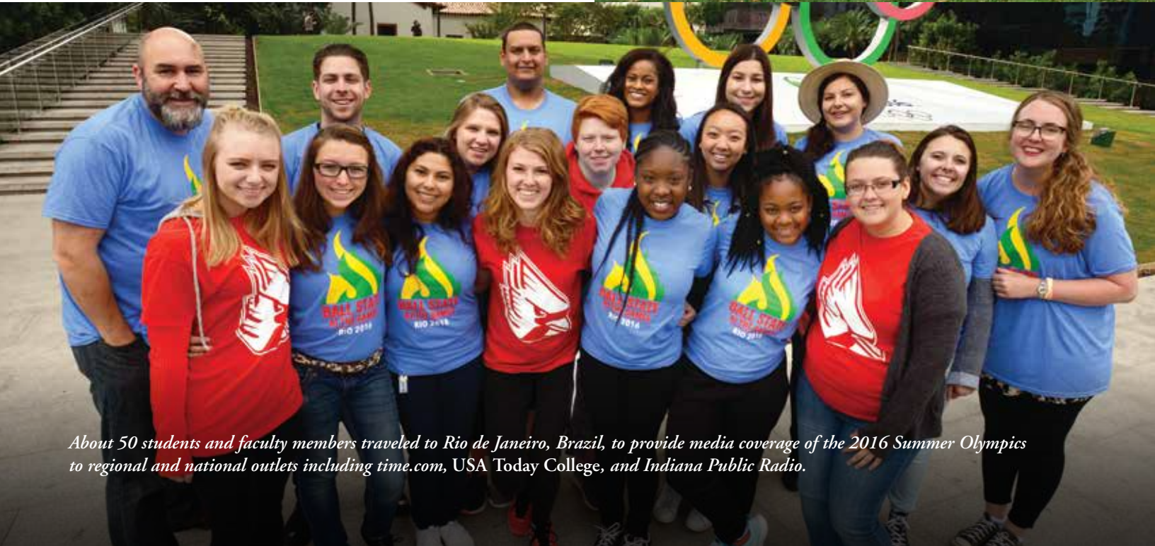
About 50 students and faculty members traveled to Rio de Janeiro, Brazil, to provide media coverage of the 2016 Summer Olympics to regional and national outlets including time.com, USA Today College, and Indiana Public Radio.