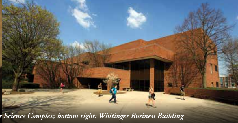
Left: College of Architecture and Planning; top right: Cooper Science Complex; bottom right: Whiting Business Building