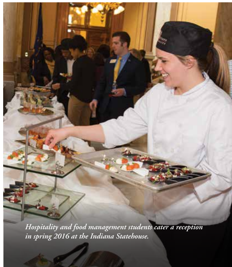
Hospitality and food management students cater a reception in spring 2016 at the Indiana Statehouse.

That alignment has served the university well in terms of this year's expected performance outcomes, as the implementation of our previous and current strategic plans have produced results. In the current biennium, we are demonstrating growth in every metric, and we are meeting every metric with the exception of high-impact doctoral degrees granted, which is flat. While Ball State has been positively meeting the state's metrics, due to the nature of the performance funding formula, Ball State has only recently seen increases in its performance funding. Between the lag time and volume needed to perform well under the performance funding formula, robust baseline funding will remain crucial to Ball State University's ability to make critical investments in our students, faculty, and classrooms.