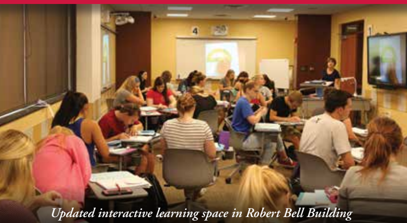
Updated interactive learning space in Robert Bell Building