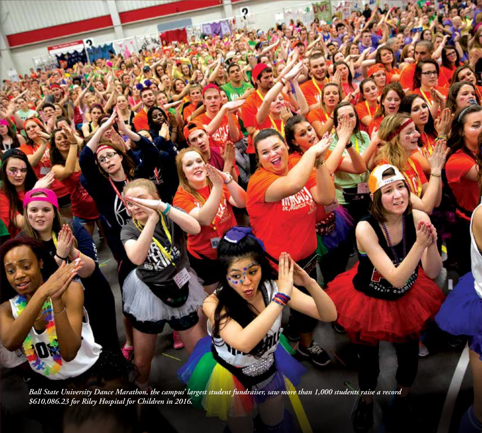
Ball State University Dance Marathon, the campus' largest student fundraiser, saw more than 1,000 students raise a record $610,086.23 for Riley Hospital for Children in 2016.