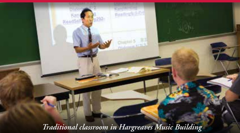
Traditional classroom in Hargreaves Music Building