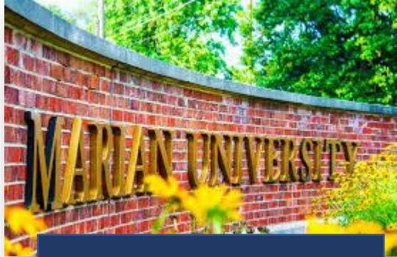
Marian University Indianapolis 75 Full Tuition Scholarships for 21 st Century Scholars