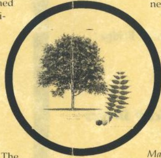
The Walnut Grove once stretched from Grouseland to Vincennes Frenchtown