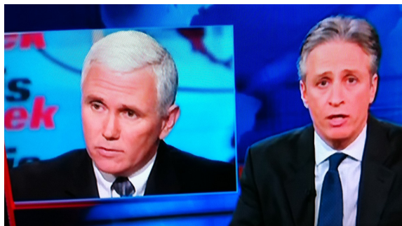
Rep. Pence's Planned Parenthood issue was a topic on Jon Stewart's "Daily Show."

It's important to understand Pence's political trajectory. He lost two challenges to U.S. Rep. Phil Sharp back in 1988 and 1990. He won what is now the 6th CD when U.S. Rep. McIntosh handed it off to him on his way to the 2000 gubernatorial race. Like Pence is now, McIntosh was wooed by Hoosier Republicans to get into the 2000 governor race, had the pro-life, evangelical base, and then