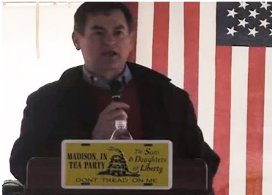
Richard Mourdock is shown here in Democratic Party tracker video challenging the Madison Tea Party members to find entitlements in the U.S. Constitution.