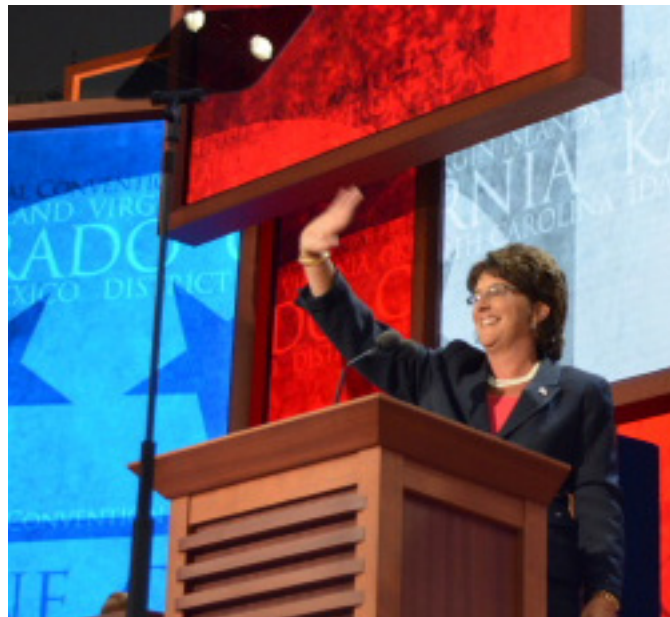
2nd CD Republican nominee Jackie Walorski waves from the podium at the Republican National Convention on Tuesday. She was the only Hoosier to address the convention.

“As a veteran, I am deeply disappointed that a fellow veteran would condone the