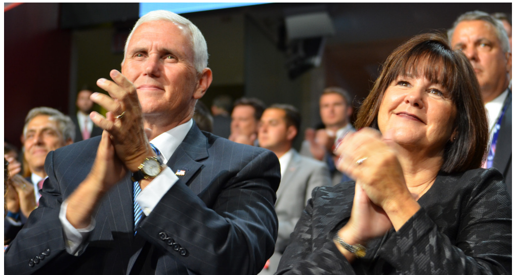
Gov. Mike Pence and First Lady Karen Pence await Republican presidential nominee Donald Trump Thursday in Cleveland.

Mike Pence, Indiana governor and Trump vice-presidential candidate, faced a staggering task in closing the proceedings on Wednesday evening. The prospect of