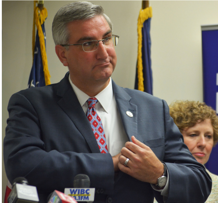
Lt. Gov. Eric Holcomb reacts to his nomination Tuesday as U.S. Rep. Susan Brooks looks on.

Just minutes after Holcomb won a second-ballot nomination by the Indiana Republican Central Committee, after leading 11-9-2