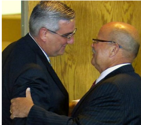
Lt. Gov. Holcomb greets Democrat John Gregg at their first joint appearance in Indianapolis on Wednesday.

Holcomb faces a time and money crunch. He will inherit the remaining parts of the Pence campaign team who didn't depart for Trump Inc., and he faces a furious