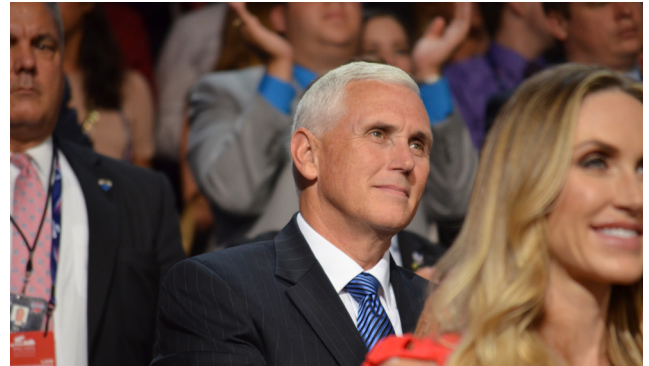
Gov. Mike Pence listens to Donald Trump's acceptance speech last Thursday in Cleveland.