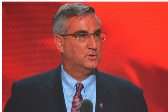
Lt. Gov. Holcomb nominated Gov. Mike Pence for vice president at the Republican National Convention in Cleveland.

"Let me just reiterate, I am going to support him," Rokita said. Brooks added, "I want to congratulate Lt. Gov. Holcomb on his selection by the state committee to be the Republican nominee for governor of Indiana and thank the committee for their time and consideration. He is a strong representative of our party and is committed to continuing the past 12 years of fiscal discipline, low taxes and conservative leadership of our state that has boosted our economy and brought good jobs for Hoosiers. Over the next 105 days, I will work hard to support Lt. Gov. Holcomb and to