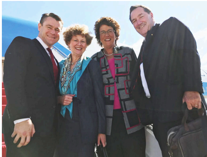
U.S. Sen. Todd Young, Rep. Susan Brooks, Jackie Walorski and Sen. Joe Donnelly after disembarking Air Force One on Wednesday.