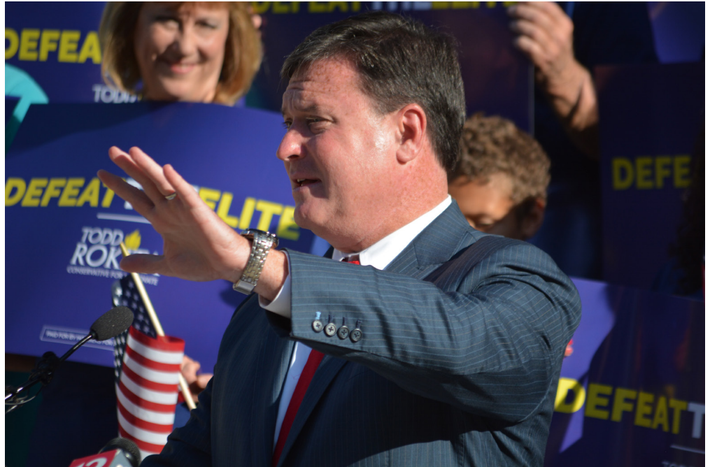
U.S. Rep. Todd Rokita posted $450,000 in the third quarter, but he and Messer have nearly an identical cash on hand.

servative revolt," endorsing State Sen. Kelli Ward over Arizona Sen. Jeff Flake – the first sitting Republican senator to be formally targeted by the pro-Donald Trump group. "Americans are tired of the inaction from the Washington