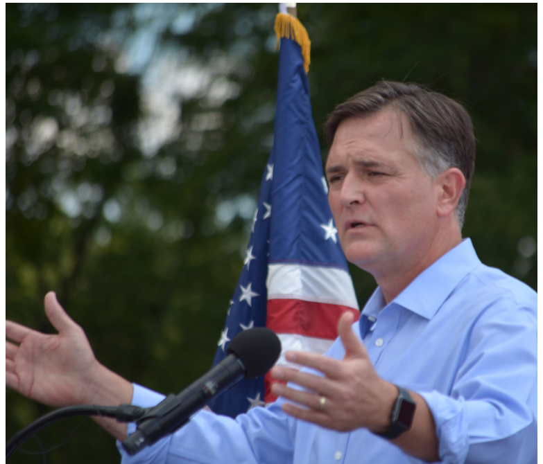
U.S. Rep. Luke Messer posted $735,000 in the third quarter FEC report.

So this is the dilemma for Messer and Rokita. Both