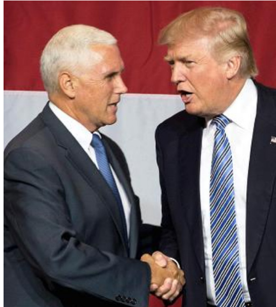
Indiana Gov. Mike Pence and Donald Trump formed the 2016 Republican ticket.