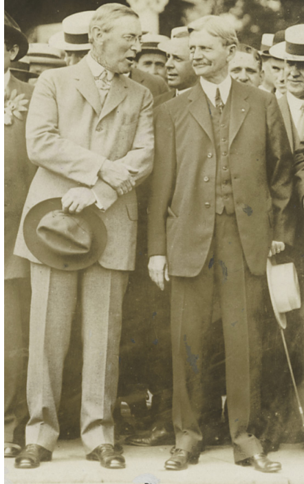
President Woodrow Wilson and Vice President Thomas R. Marshall, another former Indiana governor.

As for succession, the first two sections of the 25th Amendment were used in 1973 when Vice President Spiro Agnew resigned after pleading guilty to corruption, and again in 1974 after President Nixon resigned to avoid impeachment in the Watergate scandal. Americans ended up with an unelected administration of President Gerald Ford and Vice President Nelson Rockefeller.