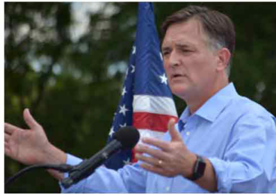
U.S. Reps. Todd Rokita (top) and Luke Messer at their campaign kickoffs.

because of it. If he does not, Messer will gain significant momentum going into filing. Still, at the end of the day, Messer will need to attack Rokita to counter what is the logical Rokita major thrust that could be politically fatal. But Rokita has his own vulnerabilities, as does Donnelly. The campaign is just beginning. We obviously don't know the unknown.