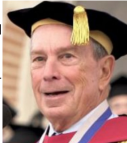
Former New York City mayor Michael Bloomberg

If professional journalism succumbs and is replaced by bloggers and entertainers, the result will be competing alternative facts, as White House adviser Kellyanne Conway famously put it. This comes as murder rates are spiking in rural communities and drug epidemics shudder dwindling emergency rooms, overcrowded county jails, strained sheriff departments and social service workers.