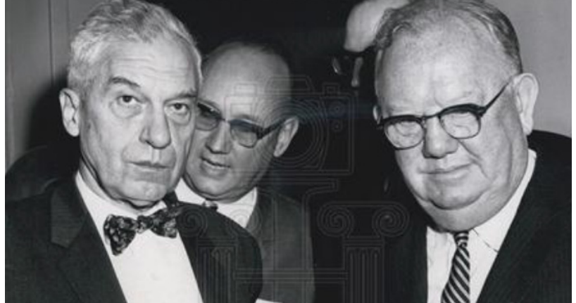
U.S. Rep. William Bray and U.S. Sen. Homer Capehart.