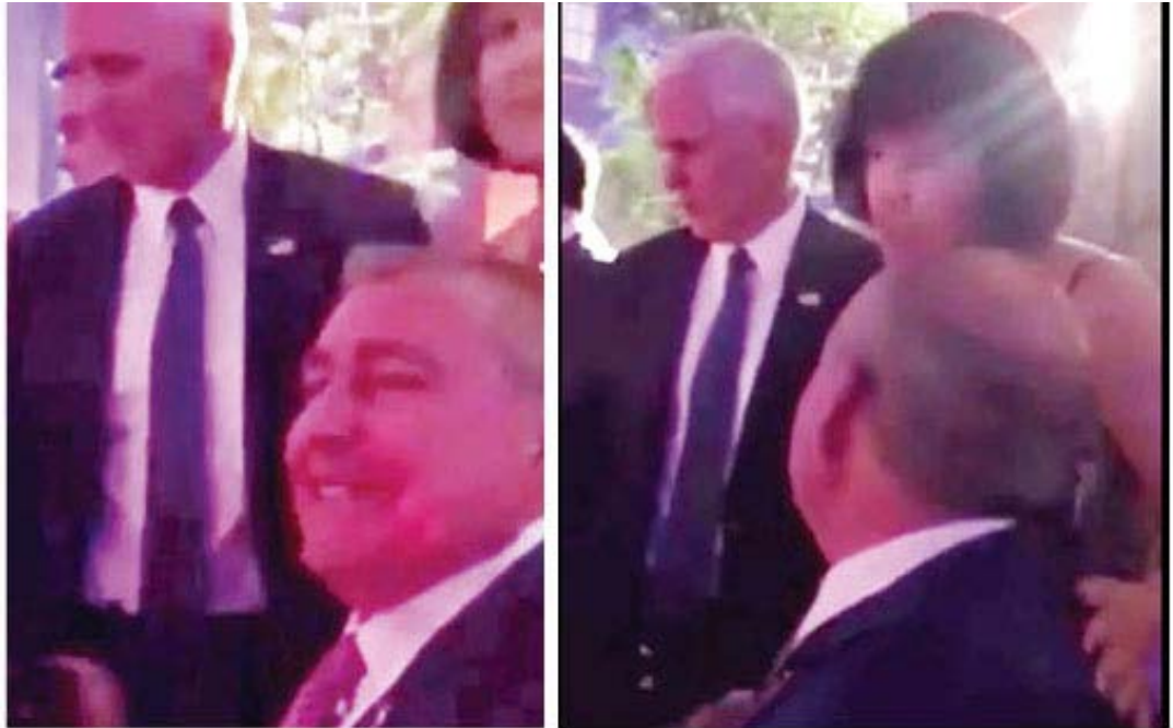
Vice President Pence and Second Lady Karen Pence with Lev Parnas in a video the indicted friend of Rudy Giuliani's attorney posted on Monday.

As the week drew to a close, Pence quoted from JFK's "Profiles in Courage" on the need for the Senate to dismiss the impeachment case against President Trump resulting from the Ukraine scandal. Pence cited Kansas Sen. Edmund V. Ross for defying his fellow Republicans, preventing President Andrew Johnson's 1868 im-