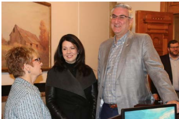
Secretary of State Connie Lawson greets Gov. Eric Holcomb and First Lady Janet Holcomb as he filed his reelection ballot signatures on Tuesday.