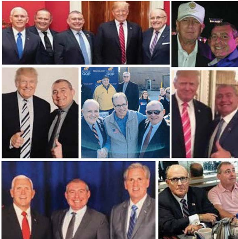
Both President Trump and Vice President Trump have disavowed knowing Lev Parnas, but a number of photos have surfaced showing otherwise. The center photo is Parnas and Trump's personal attorney Rudolph Giuliani with then Senate candidate Mike Braun in Warren County in October 2016.