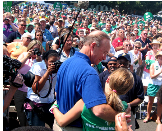
Gov. Daniels kicks off his campaign at Hinkle Fieldhouse last Saturday. Lt. Gov. Becky Skillman is behind him below.

He called the gathering a "convocation of the builders, the doers, the people prepared to aim higher." Daniels