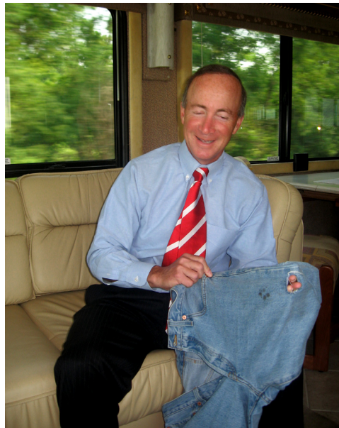
Gov. Daniels shows off his bloody jeans and the dog bite perforations on RV1. Motorhomes don't scare hounds like Harleys.