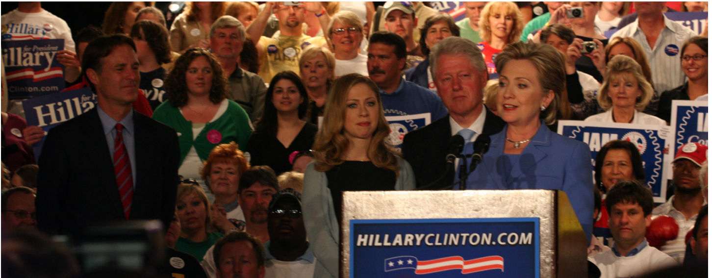
Sen. Evan Bayh looks on as the Clintons project victory in Indiana on May 6 even though the networks hadn't called the race. Gary Mayor Rudy Clay had denied them the momentum they needed as super delegates began cascading to Obama the following day.

has encompassed personal phone calls, dinner dates, and sometimes acrimonious arm-twisting. The covert organizing has miffed Obama supporters and impartial party leaders hoping that neutrality will mitigate post-primary fractures in the party.