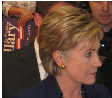
Hillary Clinton at the Wigwam in Anderson and Obama at Garfield Park in Indianapolis.