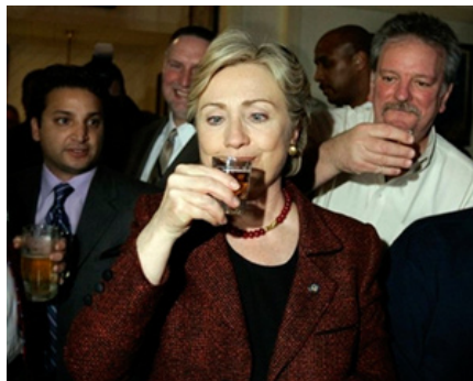
Hillary did shots at Bronko's in Crown Point in mid-April, while Obama appeared with Rep. Baron Hill at IU.

3, it was over. America had its first minority presidential nominee, eclipsing the Hillary gender dream of getting there first, buoyed by millions of women. Four days later, Clinton suspended her campaign and endorsed her bitter rival, though she said the glass ceiling had "18 million cracks."