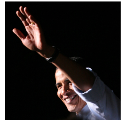
Obama at the American Legion Mall on primary eve. He would declare victory on June 3 and just days later, put staffers back in Indiana.

Yet Obama ended his spring Hoosier experience with a 21,000-person rally at the American Legion Mall in downtown Indianapolis on the eve of the primary, perhaps the largest political rally since the Ku Klux Klan took over the state eight decades before. "I'm not out to win an election," said Obama, who would lose Indiana but win this political war. "I'm here to change the country." ❖