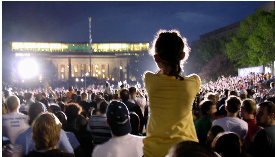
The girl on the shoulders was one of 21,000 who turned out for Obama at the American Legion Mall on May 5. At left, Hillary Clinton at the J-J Dinner and Obama in Evansville.

Howey Politics Indiana suggested the Hoosier state could be a battleground in late 2007, though we thought it more likely to be the Republicans, not the Democrats. But hours after Super Tuesday as Hillary Clinton began sinking into a 12-primary defeat hole, we told you this: For the first time since 1992, Indiana Democratic voters will have a contested presidential primary that will draw in the candi-