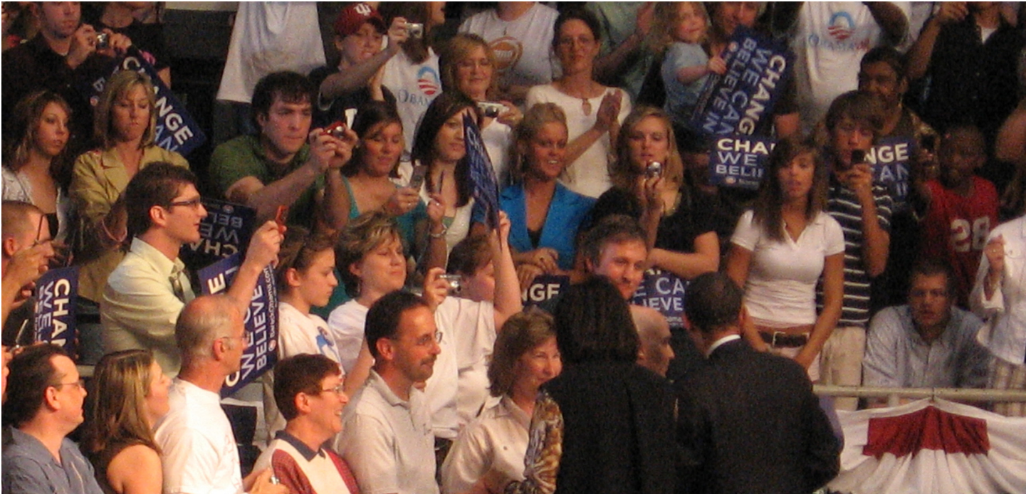
Sen. Barack Obama and wife Michelle greeted eager Hoosiers in Evansville on the night of his loss to Pennsylvania. He became much more hands-on in the final two weeks in Indiana.