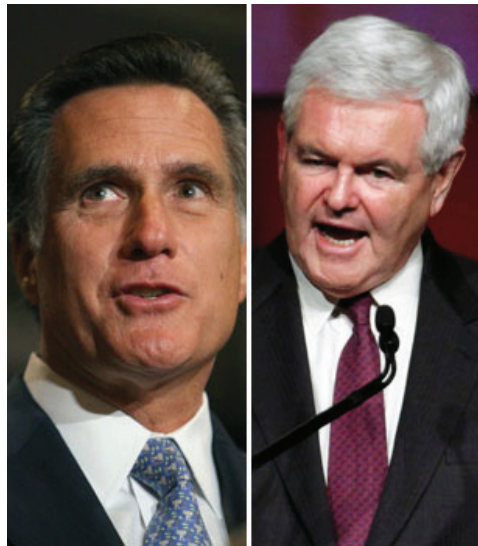
Mitt Romney and Newt Gingrich

As for President Obama, there is disappointment with him, too. I covered probably 20 Obama campaign events in Indiana in 2008 and I heard him say over and over and over how he would reach out to Republicans and that they would have seats at the table. He said at Grant Park on Election Night how much he needed them. Specifi-