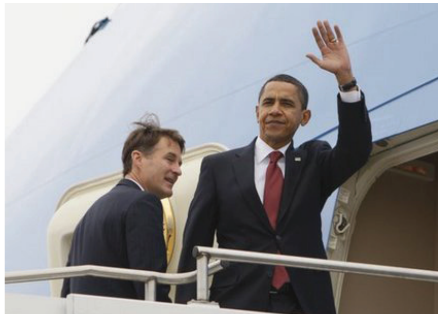
President Obama with U.S. Sen. Evan Bayh at South Bend boarding Air Force One.

Like bees trying to extract nectar from the most radiant flower in the garden, the journalistic swarm hovers around Sen. Max Baucus, D-Montana and chairman of the Senate Finance Committee, which this week became the last of five congressional panels to approve a health care