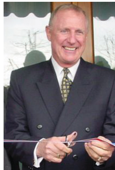
U.S. Rep. Dan Burton will still maintain a money lead over his closest challenger after reporting $164,881 in the third quarter.