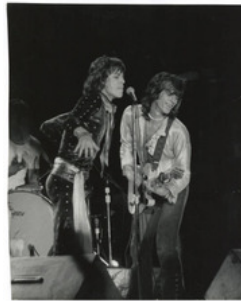
Mick Jagger and Keith Richards of the Rolling Stones