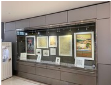
exhibit at Indianapolis International Airport

The Indiana State Library and the Indy Arts Council have partnered to create an exhibit detailing the railway experience in the Hoosier state. Titled "Passengers: The Indiana Railway Experience," the exhibit will be on display at the Indianapolis International Airport in Concourse A and B until July 17.