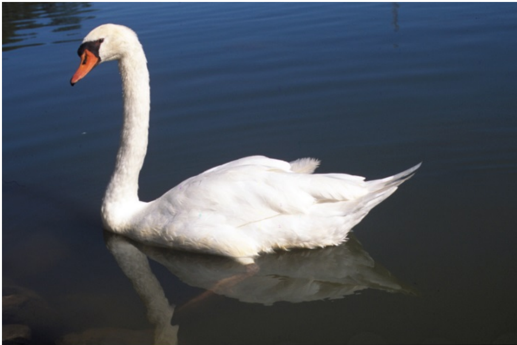
Mute swan numbers are increasing in Indiana lakes.

Continued warming temperatures and climate trends could make conditions in Indiana suitable for colonization by a greater number of species or allow species that have already colonized Indiana to exhibit more invasive tendencies than they currently do. As a result, invasive species priorities will continue to evolve and should be assessed at regular intervals.