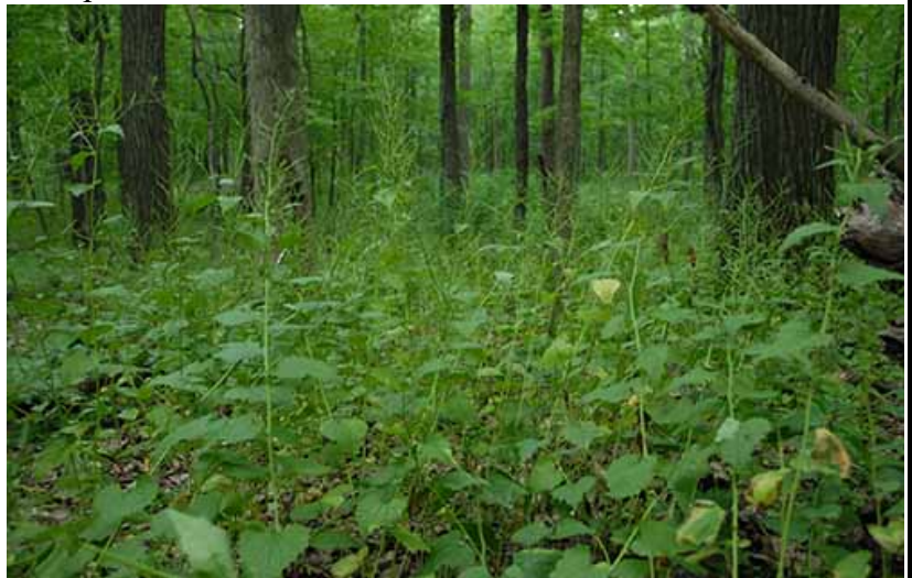
Garlic mustard is a widespread invasive in Indiana.