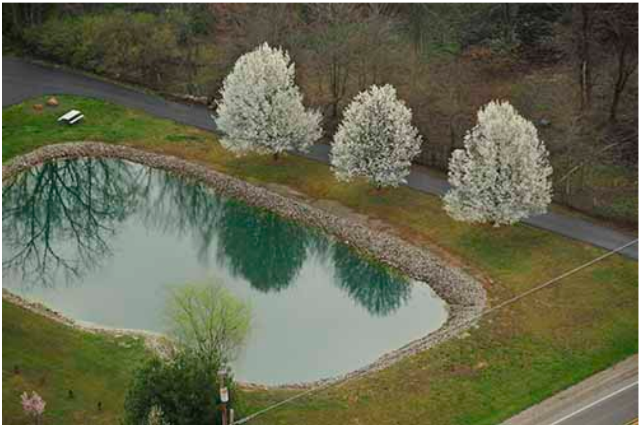
Callery pear trees are widely planted in Indiana landscapes and are now escaping into natural areas.

U.S. Fish & Wildlife Service. 2019. https://www.fws.gov/injuriouswildlife/pdf_files/Current_Listed_IW.pdf