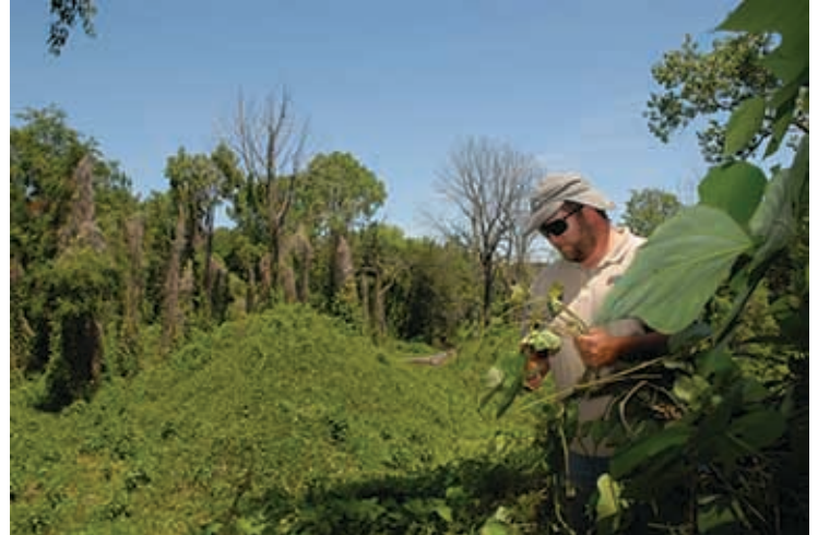
Kudzu population in Indiana (DNR file photo).