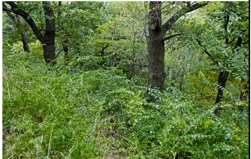
Bush honeysuckle dominates the understory of an Indiana forest.

DFW staff recognizes that management of invasive plant species should not focus only on those species for which there have thus far been documented negative impacts on Indiana wildlife because these impacts may not be known for many of the newer invaders or species yet to arrive in the state. Consideration of impacts resulting from invasions in other states with similar community types and climate to Indiana's can help DFW predict how Indiana's wildlife populations and ecosystems may be affected. This review of invasions and impacts elsewhere may also help us understand the urgency for implementing controls.