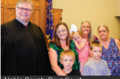
Noble County Drug Court