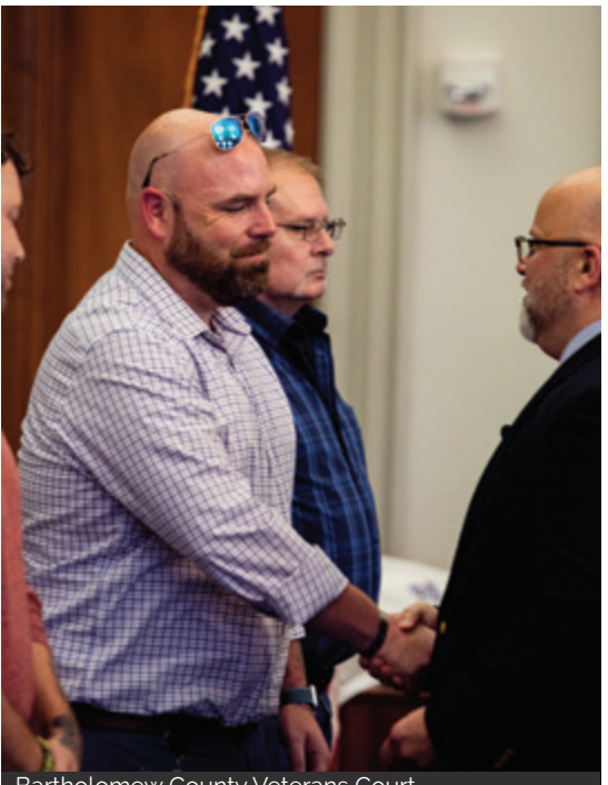
Bartholomew County Veterans Court