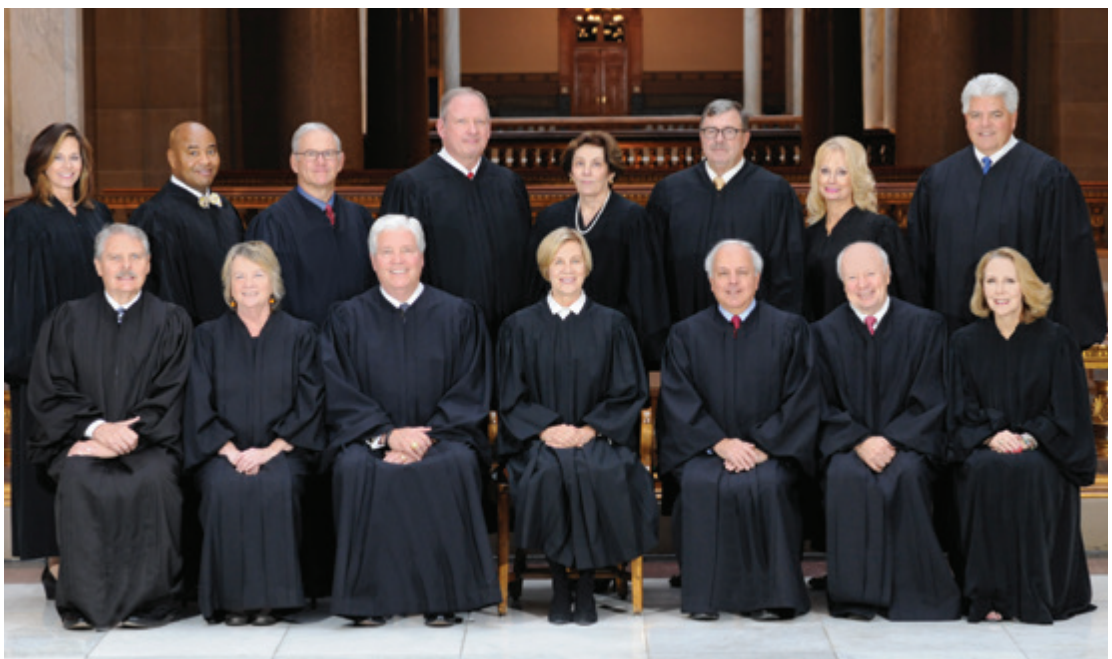
The Court of Appeals of Indiana has taken oral arguments to all 92 counties through their "Appeals on Wheels" program.