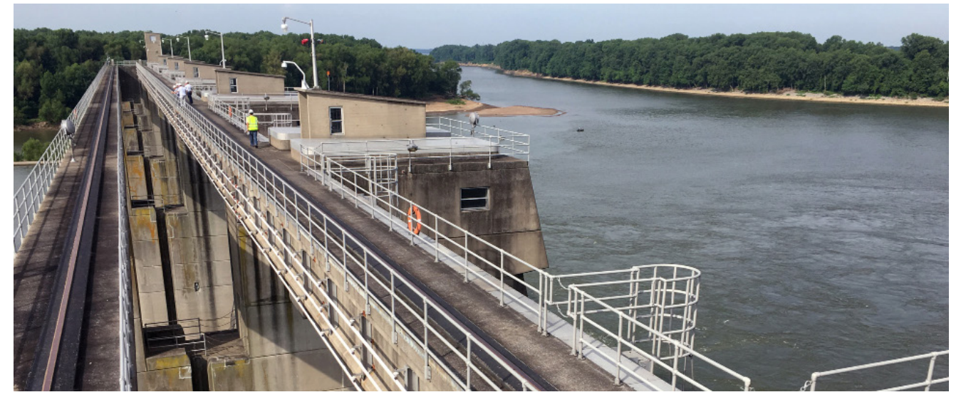
Behind the Scenes: Did you know that IDHS coordinates public and private sector resources to help protect Indiana's critical infrastructure (bridges, dams, tunnels, utilities, airports, railroads, schools, etc.) from natural and man-made threats?