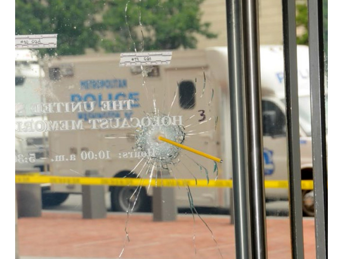
Front and Center: Did you know that IDHS provides online resources to help citizens respond in active shooter situations? Visit <u>http://in.gov/dhs/3903.htm</u> for more info.