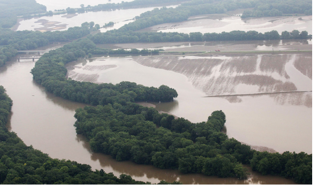
Behind the Scenes: Did you know that IDHS operates the State's Emergency Operations Center that monitors, around the clock, current, emerging or possible threats to Indiana?