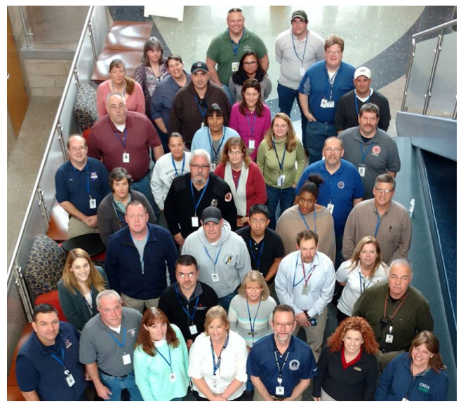
Avian Flu: Hundreds of state, federal and local responders assisted with the response to avian influenza being found on a commercial turkey farm in Dubois County. Members of the IDHS Incident Management Team are pictured along with federal and local partners.

IDHS sponsored two major cybersecurity exercises in 2016, which focused on preparing public and private sector stakeholders for a cyberattack on Indiana water utilities. A tabletop exercise took place in March at Camp Atterbury; and a full-scale exercise in May at Muscatatuck Urban Training Center near North Vernon, Indiana. Other state agencies that participated included the Indiana National Guard, Indiana Office of Technology, Indiana Information Sharing and Analysis Center (IN-ISAC), Indiana Intelligence Fusion Center and the Indiana Utility Regulatory Commission. Additional partners included the FBI, U.S. Department of Homeland Security, private utility companies and private cybersecurity firms.