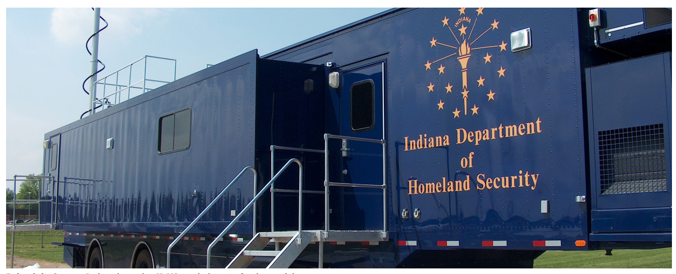
Behind the Scenes: Did you know that IDHS can deploy a 53-foot-long mobile command center to facilitate emergency response efforts anywhere in the state should disaster strike?