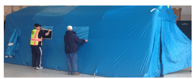
Behind the Scenes: Did you know that IDHS has a portable mortuary unit with structures and medical equipment ready for rapid deployment for a tragic mass casualty situation such as a jetliner crash?