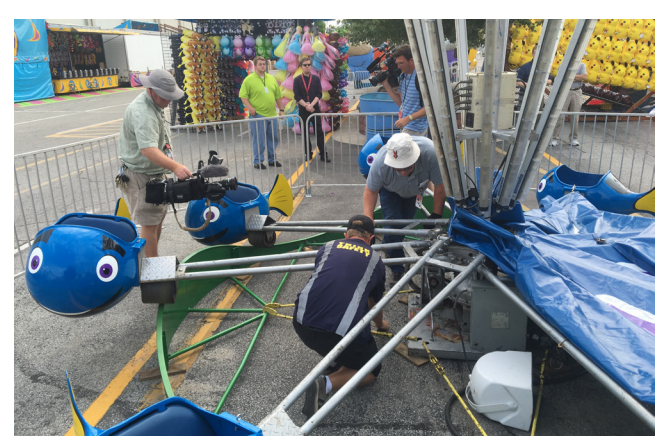
Front and Center: Did you know that IDHS inspects amusement rides at carnivals, fairs, theme parks and zoos; and in fiscal year 2015 conducted 915 such inspections?