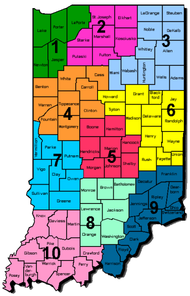
Behind the Scenes: Did you know that IDHS has 10 district coordinators stationed throughout the state to assist local public safety professionals in planning, training, emergency response and emergency recovery?