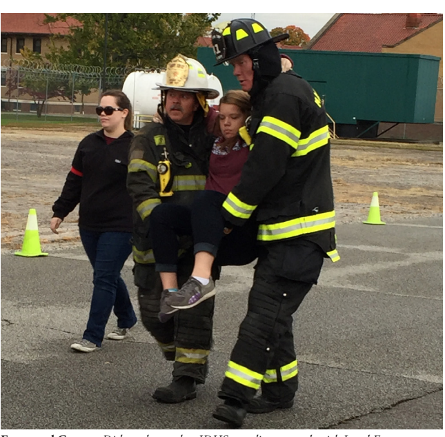
Front and Center: Did you know that IDHS coordinates work with Local Emergency Planning Committees (LEPC), which are responsible for developing and updating response plans specific to Indiana counties in case of accidental chemical spills?