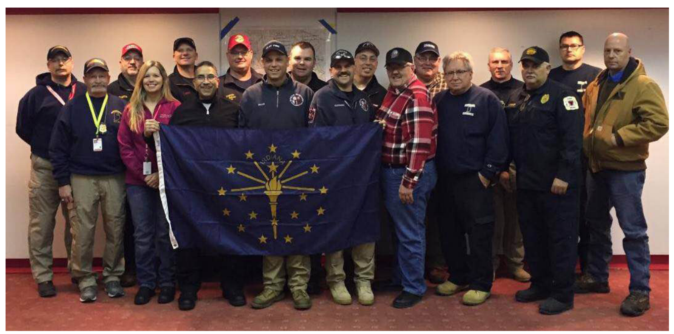
Behind the Scenes: Did you know that IDHS oversees the Indiana Incident Management Response Team, a multi-agency forward response unit that supports local Hoosier communities with advice, mentoring or management during disasters?