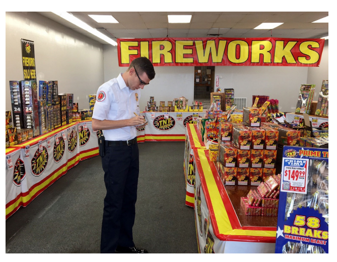
Did you know? IDHS licenses fireworks vendors to help ensure that fireworks products sold in Indiana are safe and legal. This fiscal year, IDHS issued 856 licenses to vendors.