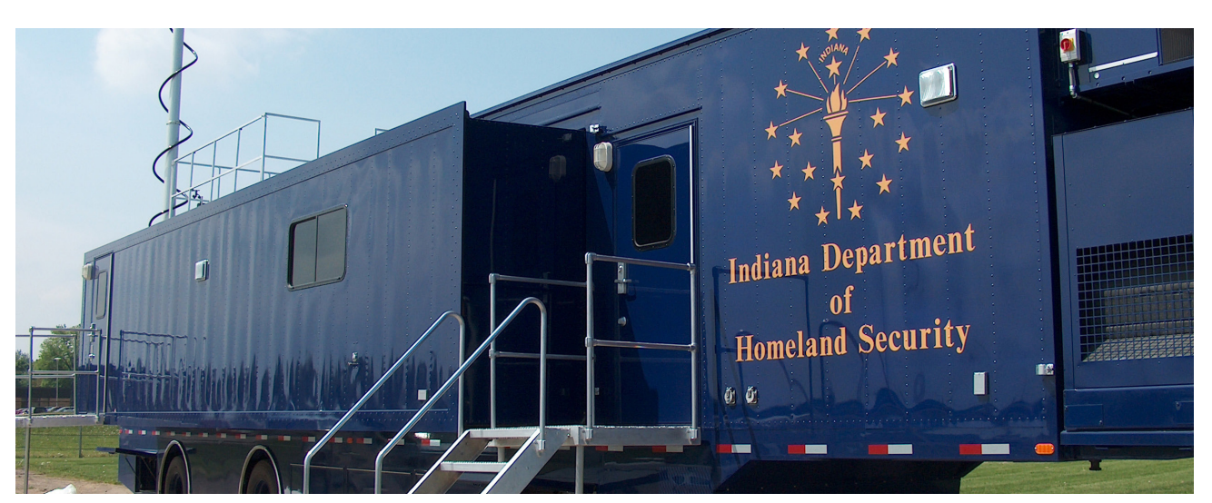
Did you know? IDHS can deploy a 53-foot-long mobile command center to facilitate emergency response efforts anywhere in the state should disaster strike.

During a major emergency IDHS establishes and coordinates a Joint Information Center with appropriate state agencies to provide quick, reliable news updates and safety messages to citizens and journalists.