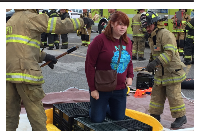
Did you know? IDHS coordinates work with Local Emergency Planning Committees, which are responsible for developing and updating response plans specific to Indiana counties in case of accidental chemical spill as well as planning and implementing exercise to practice those plans. In this fiscal year, 75 LEPC response plans were reviewed for compliance and 78 LEPCs were funded.