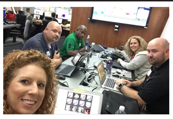
Did you know? IDHS oversees the Indiana Incident Management Assistance Team, a multi-agency forward response team that supports local Hoosier communities with advice, mentoring or management during disasters. This team is also available for deployment to other states to assist in large scale disasters, such as hurricanes, winter storms or tornadoes.