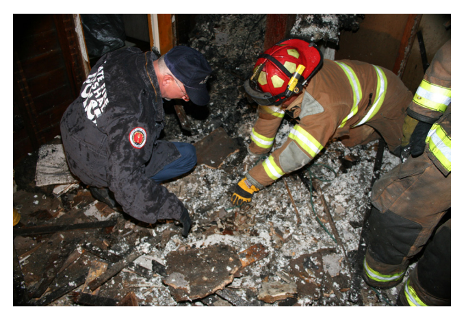
Did you know? State Fire Marshal investigators provide hands-on fire investigation training to fire departments. During Fiscal Year 2016, investigators taught 22 individuals from Jeffersonville and Clarksville Fire Departments in Clark County.