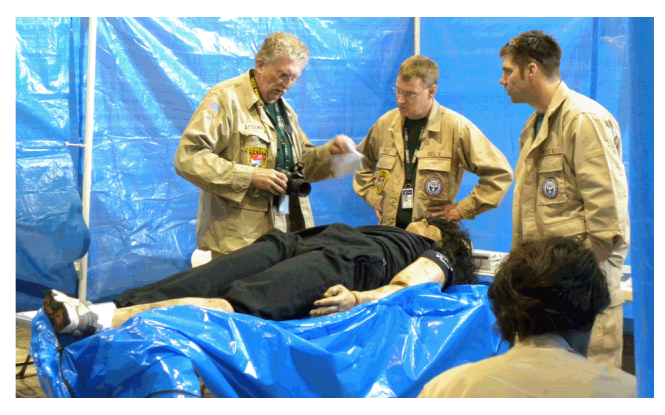
IDHS has a portable mortuary unit with structures and medical equipment ready for rapid deployment for a tragic mass casualty situation such as a jetliner crash.

The State EOC additionally assists in deploying resources to communities across the state, helping local agencies in responding to the needs of the communities. Some of the IDHS resources are highlighted below.