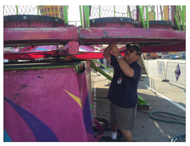
Did you know? IDHS safeguards families by inspecting amusement rides at carnivals, fairs, theme parks and zoos. This fiscal year, inspectors conducted 944 amusement ride inspections. Inspectors also put in over 600 hours of inspections during the 2017 Indiana State Fair, resulting in no substantive reported ride incidents.