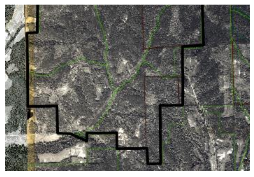
Figure 2. 1939 arial photograph of the southern section of the proposed HCVF area.