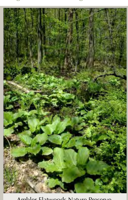
Ambler Flatwoods Nature Preserve.

Development of policies that protect natural resources and outreach activities that cultivate local land stewards.