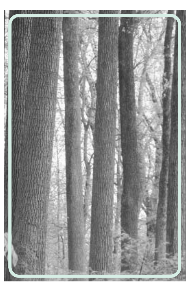
View from the Tall Timbers Trail