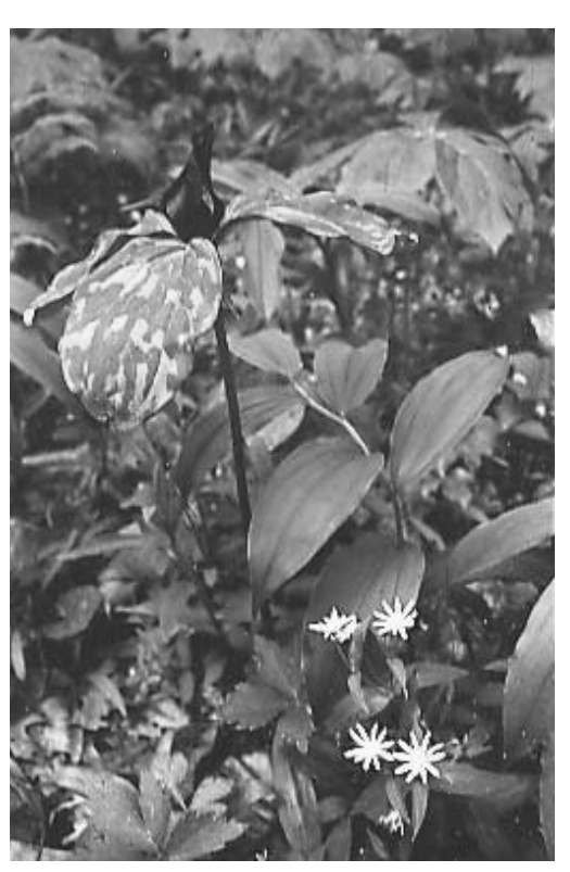
Trillium and Chickweed