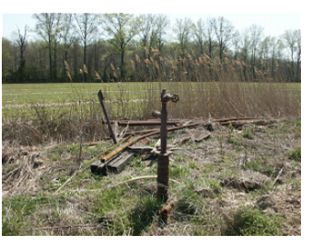
Orphaned well in Warrick County

As funds are available, plugging projects are prepared each year to plug those wells ranking highest based upon the assessment of well's risk to public health, safety, or the environment.