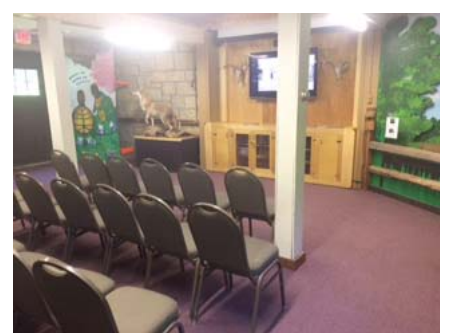
Nature Center Program Room