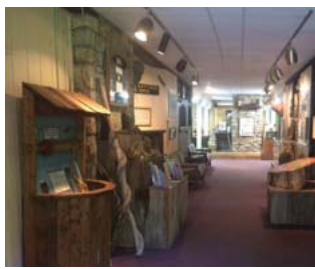
Dark entry hallway