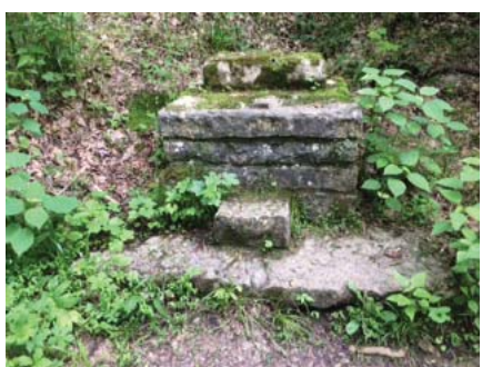
CCC Fountain Remains

The Great Depression of the 1930s resulted in President Franklin Roosevelt's creation of the Civilian Conservation Corps (CCC). This program hired single, young men to work on conservation and park projects. The timing of this program worked well for the fledgling state parks, many of which were lacking in basic infrastructure.