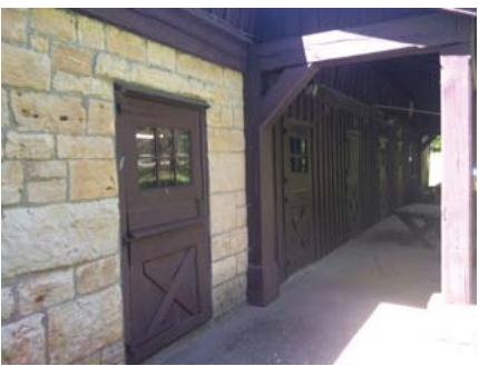
CCC-built Nature Center

The existing building should be replaced with a nature center that serves both the visitors and the Interpretive Service. Once this occurs, the historic CCC building can be restored to its former Saddle Barn appearance and used as a self-guided experience and public space. The focus would be on the CCC, the construction of the building, and its use as a saddle barn.