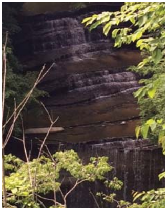
Vegetation blocking Big Clifty Falls overlook.

4. Clear vistas . Views of waterfalls and the Ohio River are important attractions at Clifty Falls. Some of the overlooks are increasingly blocked by vegetation.