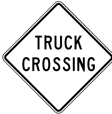
XW8-6-A XW8-6-B (1)