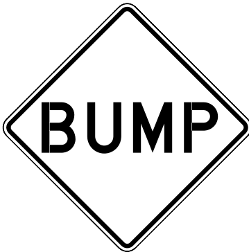
XW8-1-A XW8-1-B (1)