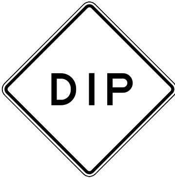
XW8-2-A XW8-2-B (1)