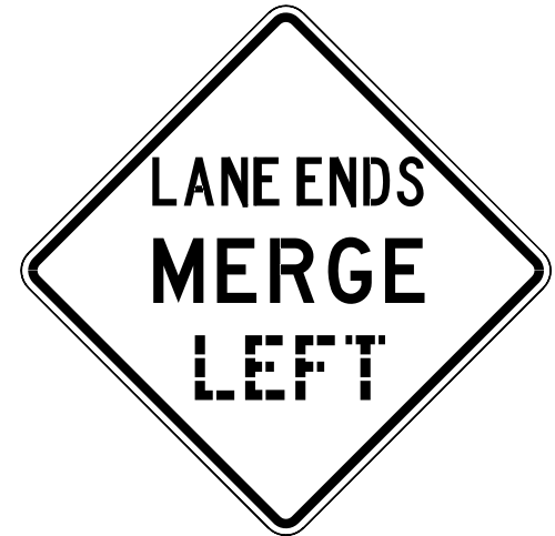
XW9-2-A (R or L)