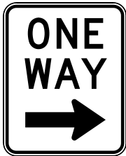
R6-2-A (R or L)