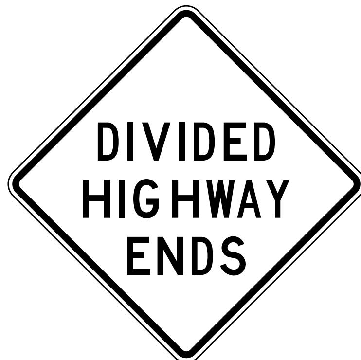
XW6-2a-A XW6-2a-B ①

All Dimensions are in mm unless otherwise specified.