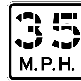
XW13-1-A (To be used below a warning sign only.)