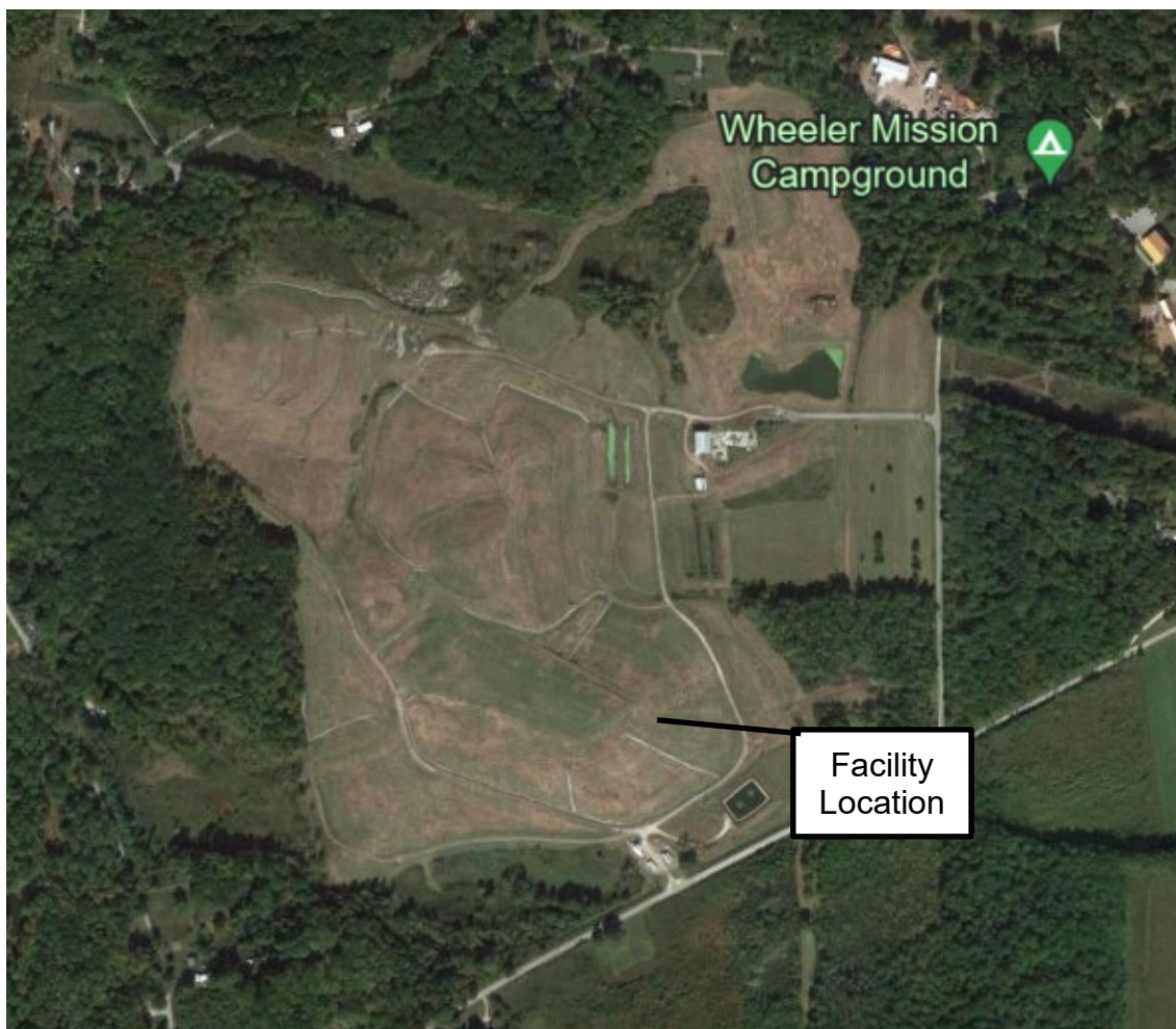
Figure 3: Site Map

A Site Map has been included as Figure 3.