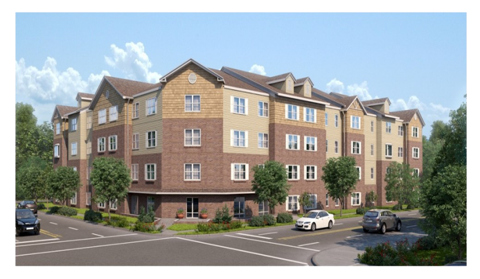
(Exterior rendering, no photo available)

First National Bank & Trust/Washington Street Senior Residences at 410 N. Washington St, Kokomo