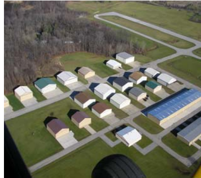
Aerial View of the infrastructure on the airport property