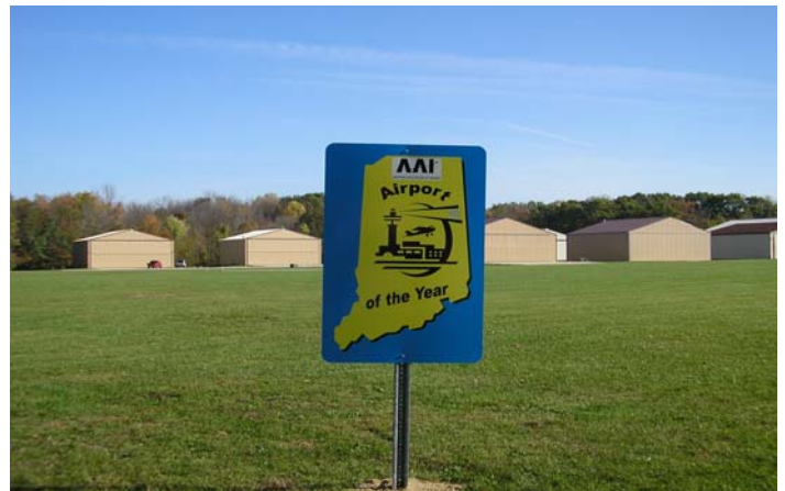
Road sign presented to Michigan City Municipal Airport in recognition of being named the Aviation Association of Indiana's Airport of the Year.