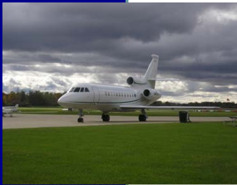
A Falcon-900 sitting on the ramp at Michigan City Municipal Airport

Michigan City offers many unique opportunities to visitors including two gaming facilities within a 10 minute drive, an outlet mall, a fire station on the Airport grounds, and the beautiful sand