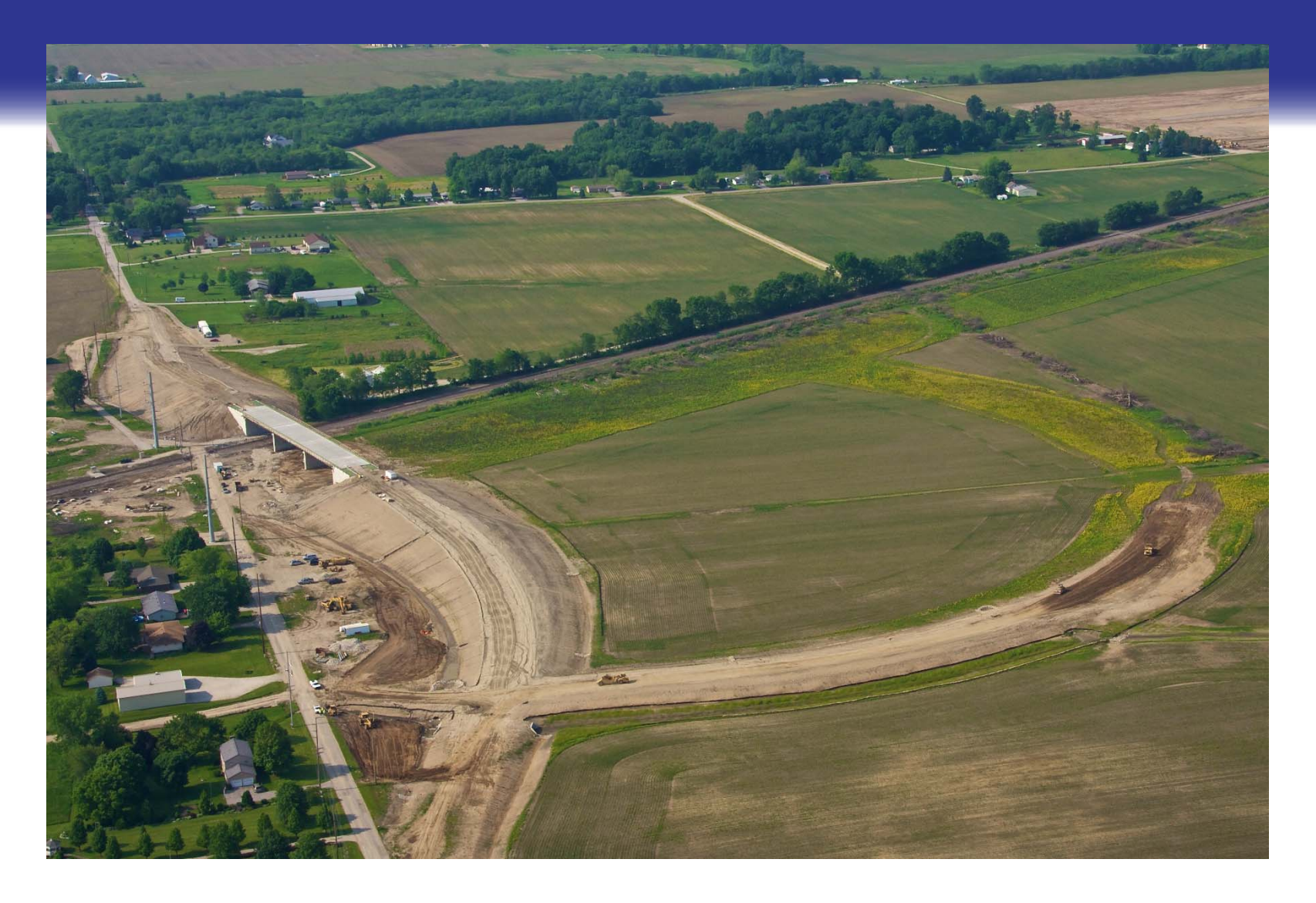
CR500E over SR25 and NSRR