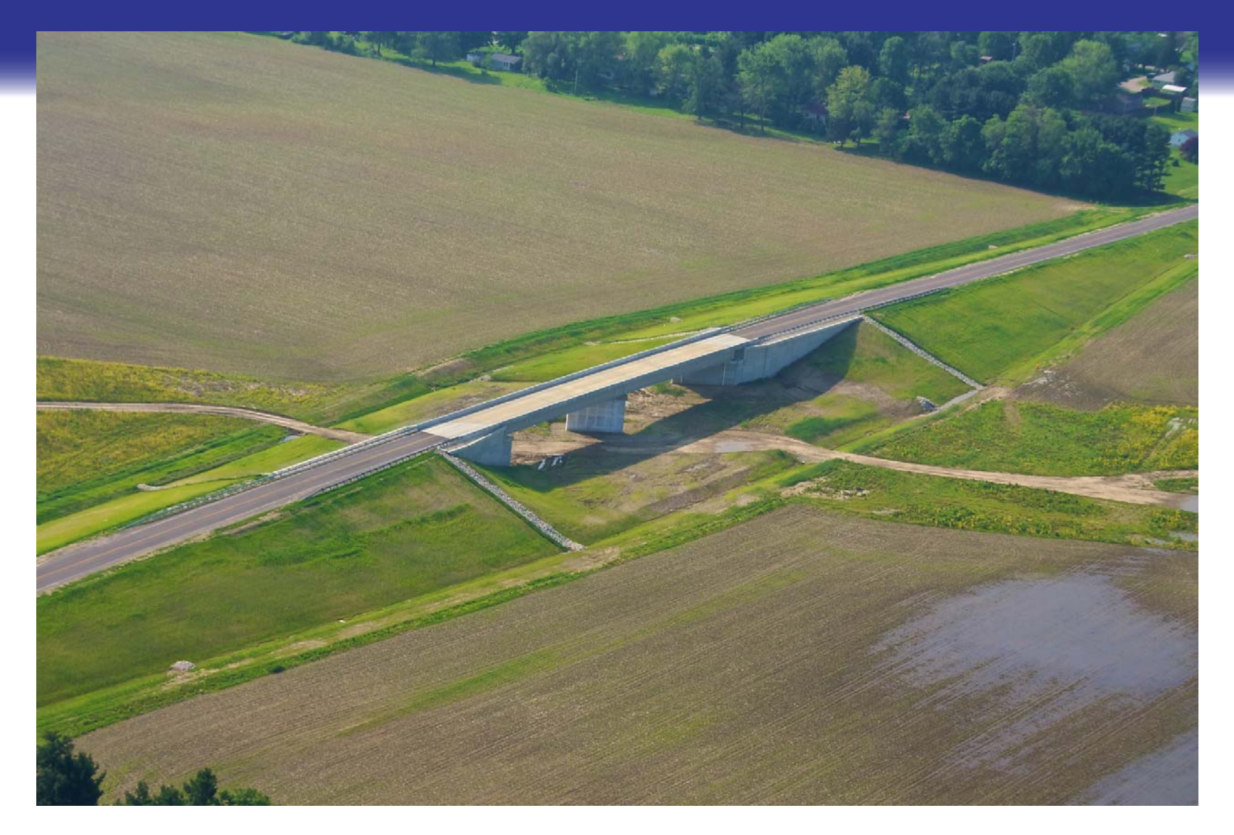
CR1000E over SR 25