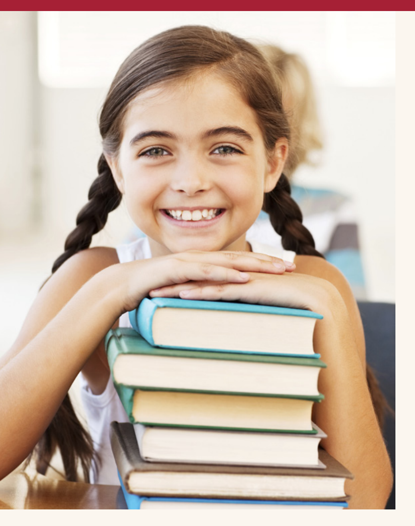
Table of Contents (continued)