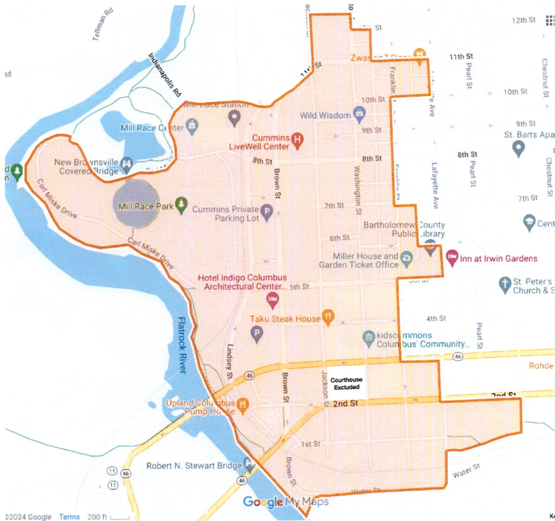
DORA BOUNDARY MAP

The Downtown Columbus Social District is identified in the map incorporated into this section, which shall be updated from time to time.