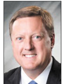
Sen. Eric Koch

A piece of proposed legislation introduced in this year's short, nonbudget session is taking a different approach to misdemeanor reimbursement and includes a new pilot program for select counties.