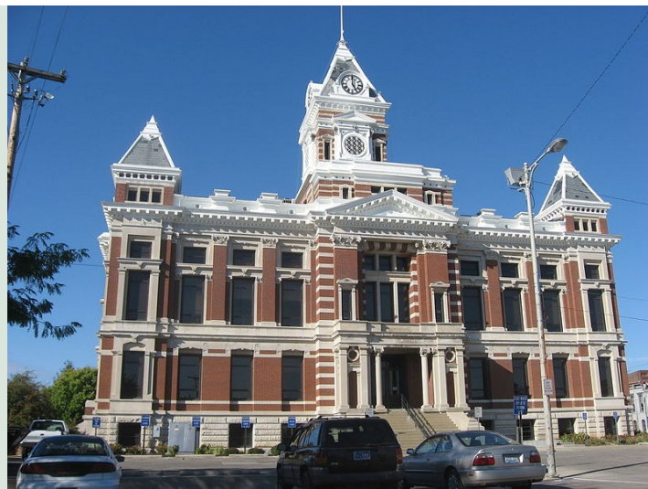
Johnson County Courthouse.

It has also come to the Commission's attention that misdemeanor representation will be an issue in the future. The Commission does not report attorneys as out of compliance on misdemeanor-only caseloads, but too many cases can give rise to sixth amendment violation claims. Please contact staff attorneys if you would like to discuss these issues.