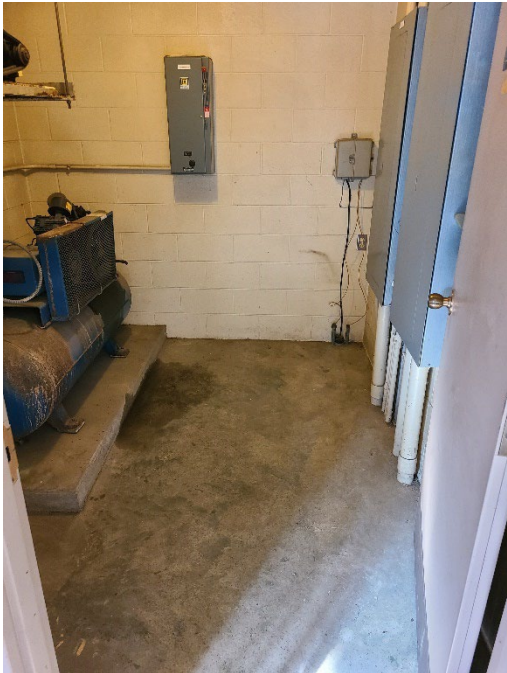
Electrical Room & Panels