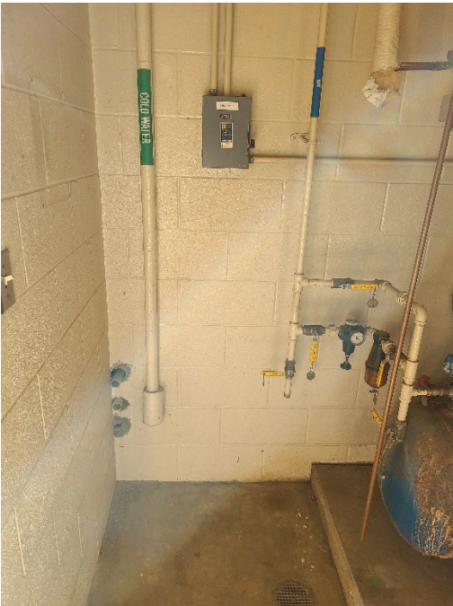
Electrical Room – Exterior Wall with Water