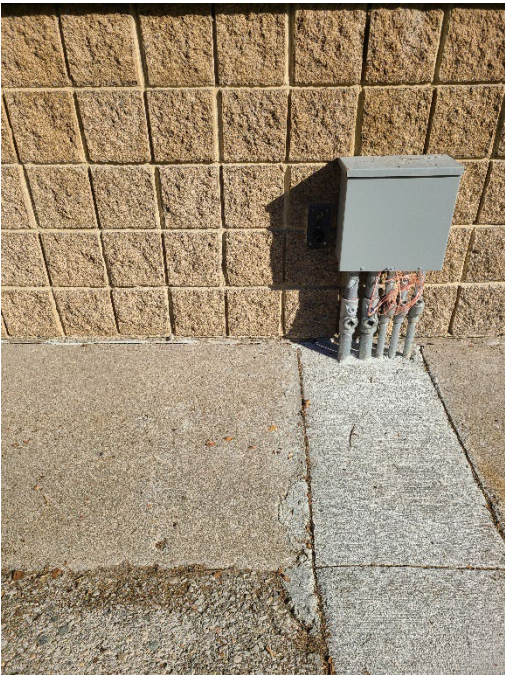
Exterior Wall with Box and Hose Bibb