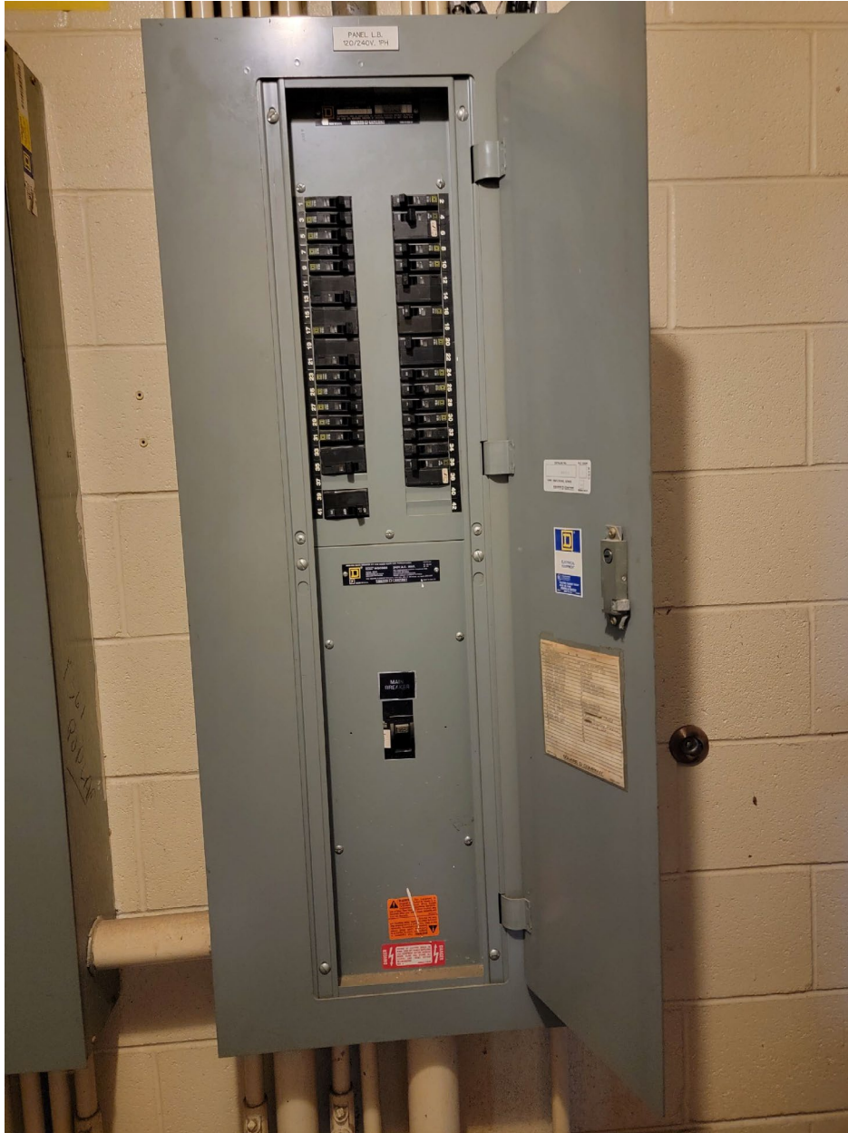
Photograph No. 6 – Existing Maintenance Building – Existing Electrical Panel L.B. 120/240V 1PH (View Looking North)