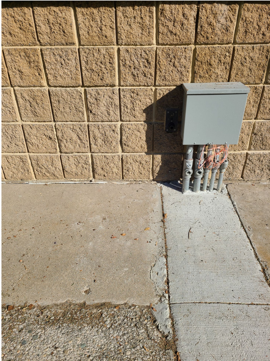
Photograph No. 8 – Existing Maintenance Building - Exterior side of Existing Electrical Room (View Looking North)