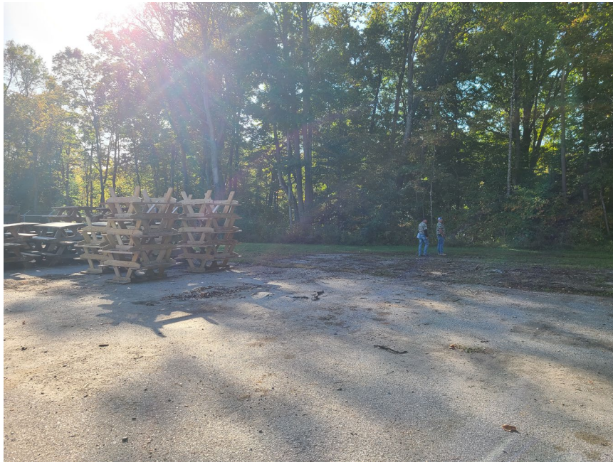
Photograph No. 2 – Proposed Staging Area (View Looking Southeast)

The Owner will remove the picnic tables east of the project site. This area may be used for staging, dumpsters, and temporary toilet facilities.