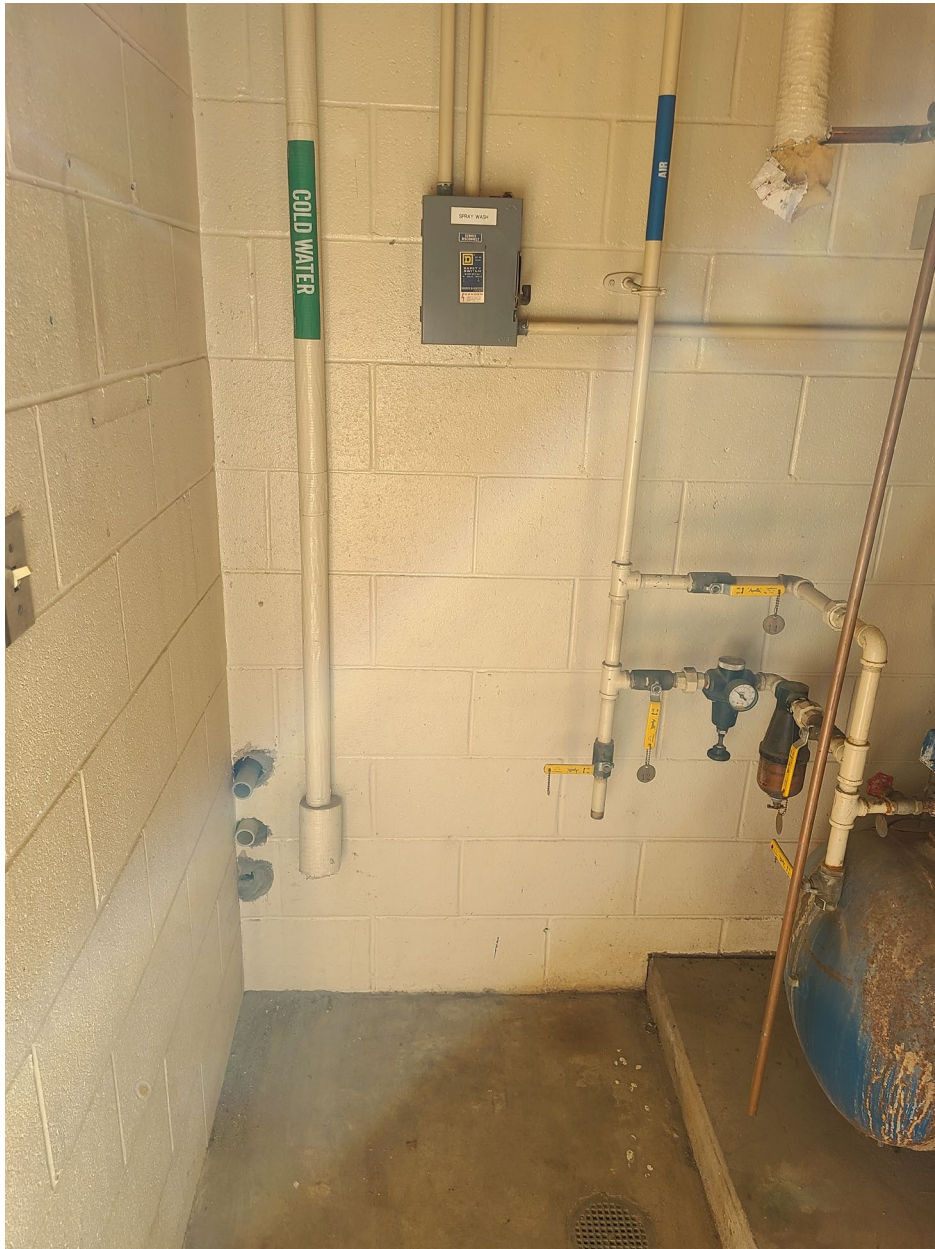
Photograph No. 7 – Existing Maintenance Building – Existing Electrical Room with existing Exterior Wall left of entrance door (View Looking South)