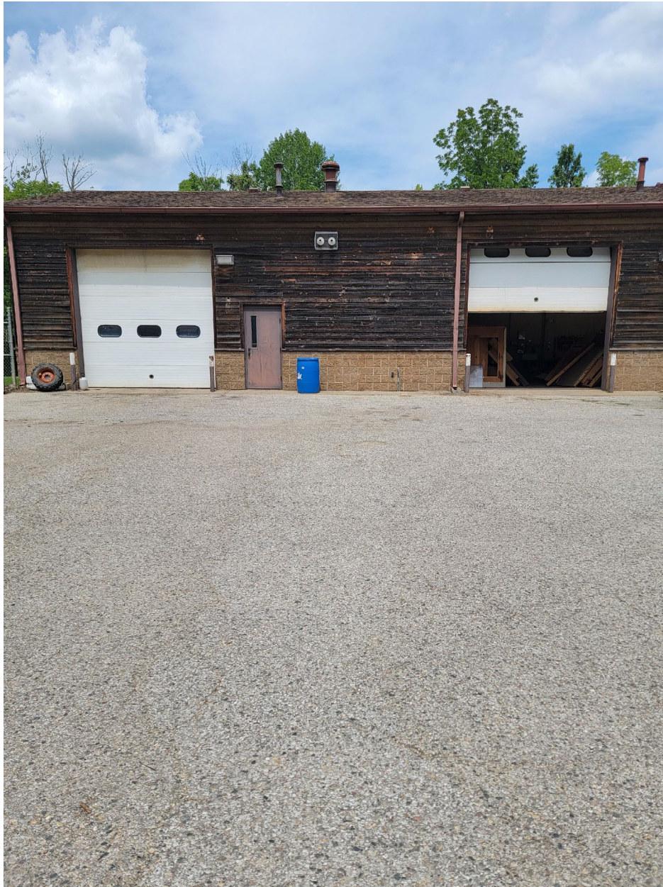
Photograph No. 4 – Existing Maintenance Building (View Looking North)