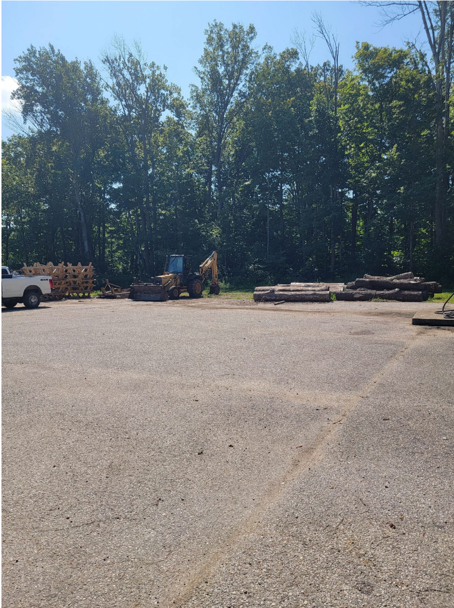
Photograph No. 1 – Proposed Pole Barn Site (View Looking South)

Previous building debris was removed to grade, and post were pulled out of the ground. Below grade conditions are unknow and not guaranteed.