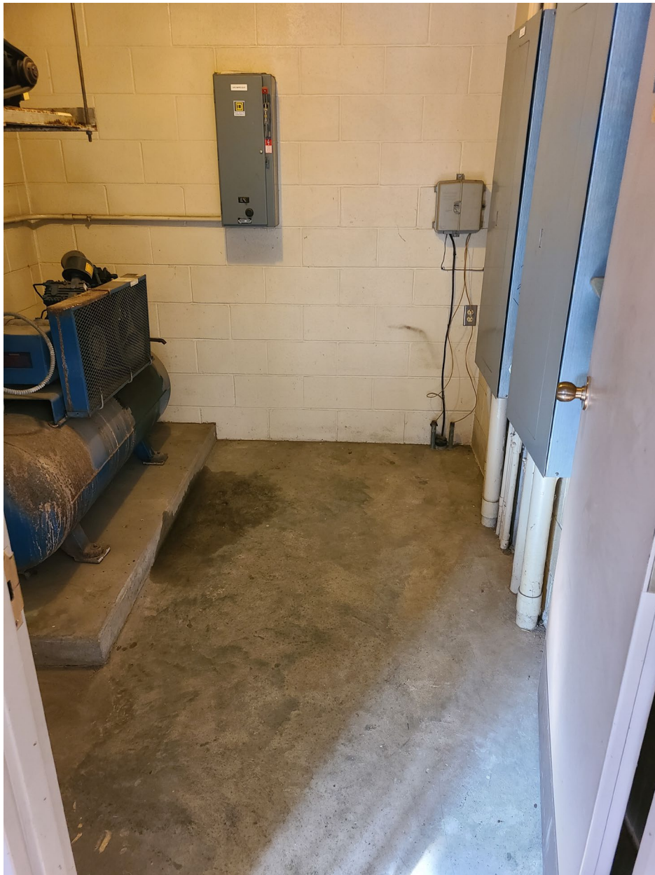
Photograph No. 5 – Existing Maintenance Building – Existing Electrical Room with existing Electrical Panel to the right (View Looking West)