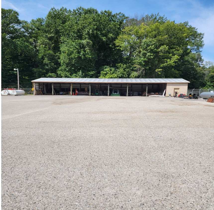
Photograph No. 3 – Existing Pole Barn (View Looking West)