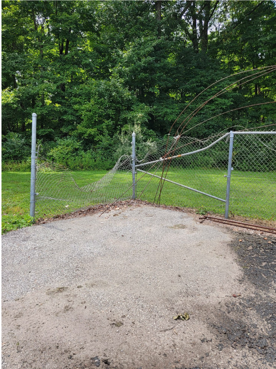
Photograph No. 6 –Existing Fence Damage