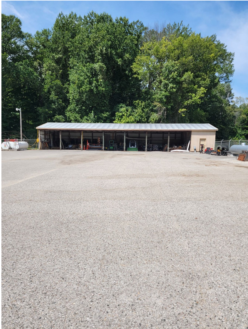
Photograph No. 2 – View Looking West – Existing Pole Barn