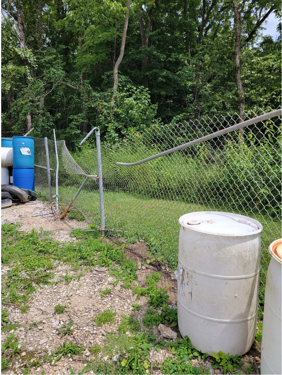
Photograph No. 5 –Existing Fence Damage