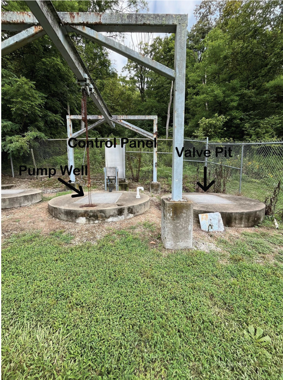
Photograph No. 1 – Attachment A