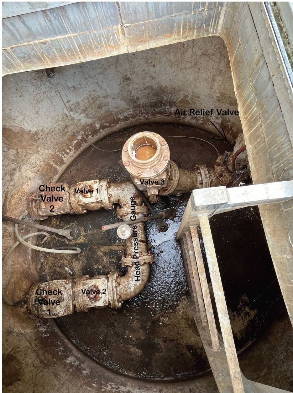
Photograph No. 3 – Attachment C