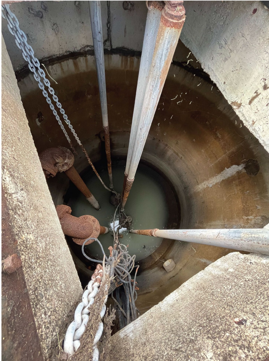
Photograph No. 5 – Attachment E