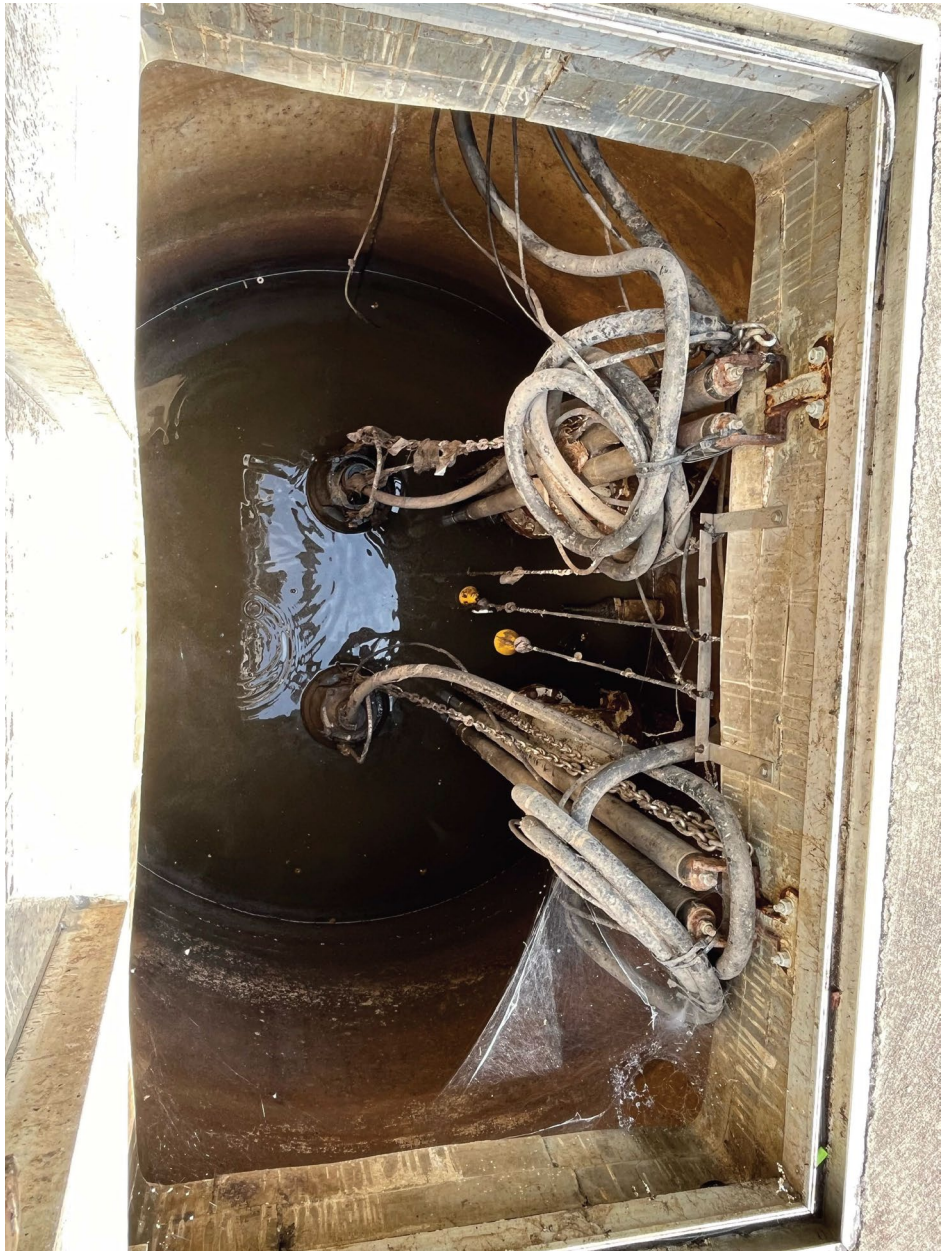
Photograph No. 4 – Attachment D