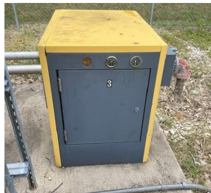
Blower #3 – Not in Service