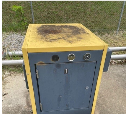
Blower #1 – Primary