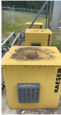
Blowers and Control Panel