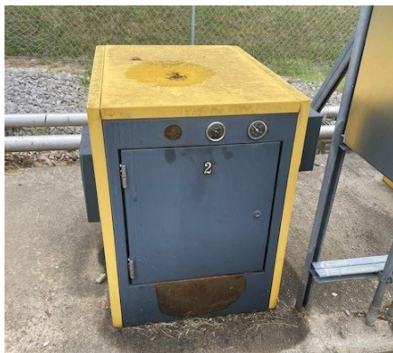
Blower #2 - Secondary