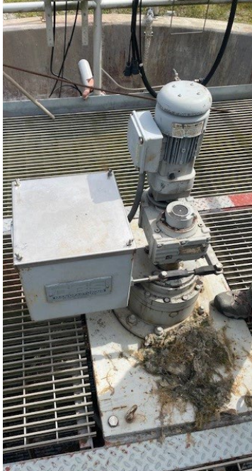
Motor and shaft