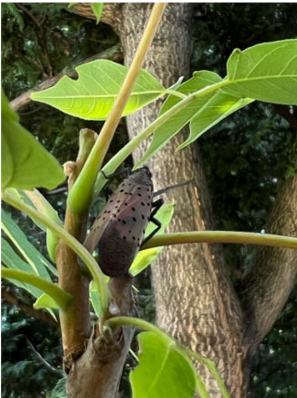
Photo 9 – Our first adult spotted lanternfly find of the season in Huntington on July 31.