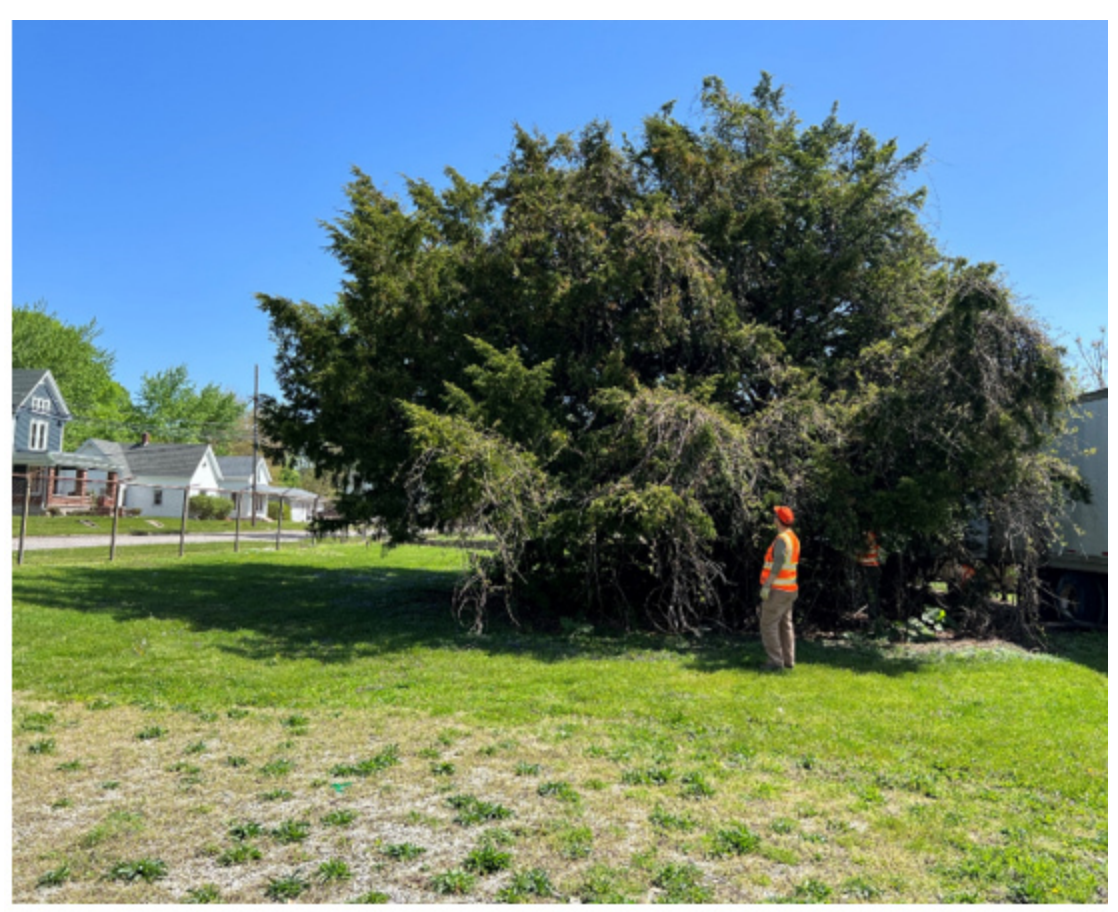
Photo 4 - Single yew from which more than 1,700 egg masses were removed