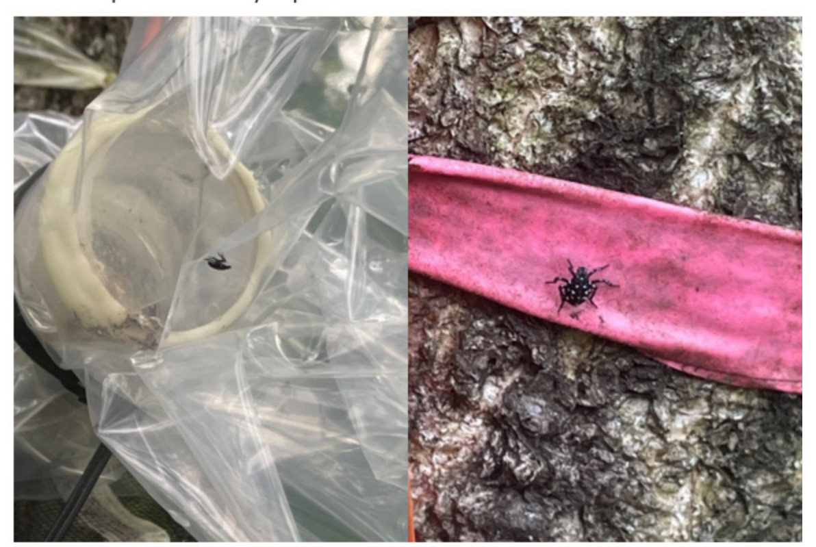
Photo 2 & 3 – Spotted lanternfly first instar nymph in trap and on tree