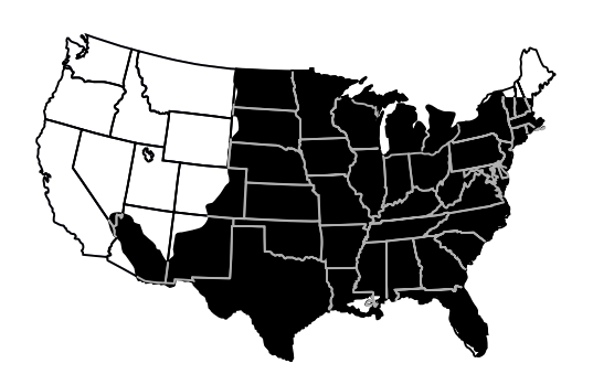
United States Distribution

The range of the eastern cottontail spans from southern Canada south to Central America. Within the United States, the cottontail is an eastern, central, and southwestern species—primarily found in the eastern two-thirds of the United States with the exception of Maine, a majority of New Hampshire and Vermont, and northeastern New York. The rabbit is absent from parts of Louisiana's coastal marsh as well. The cottontail's western limits reach as far as the Rocky Mountains in the Great Plains region, New Mexico, and Arizona.