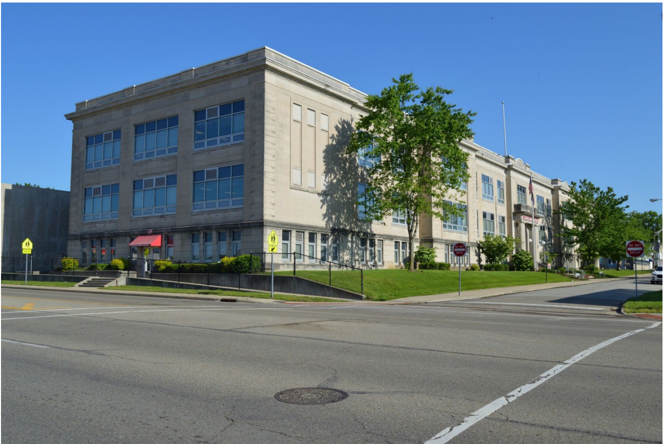
IN_Lawrence County_Bedford Northside Residential Historic District_0036