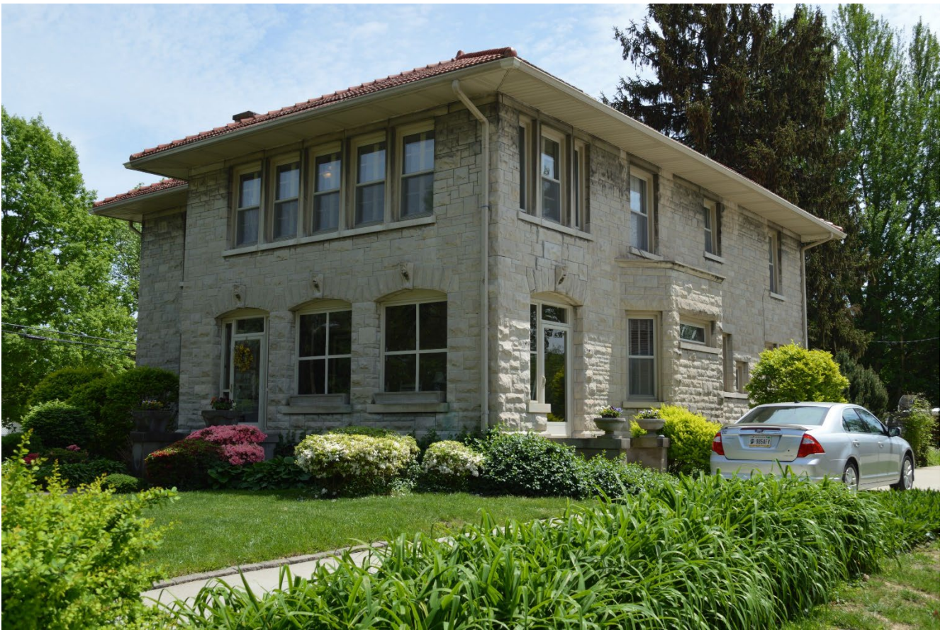
IN_Lawrence County_Bedford Northside Residential Historic District_0015