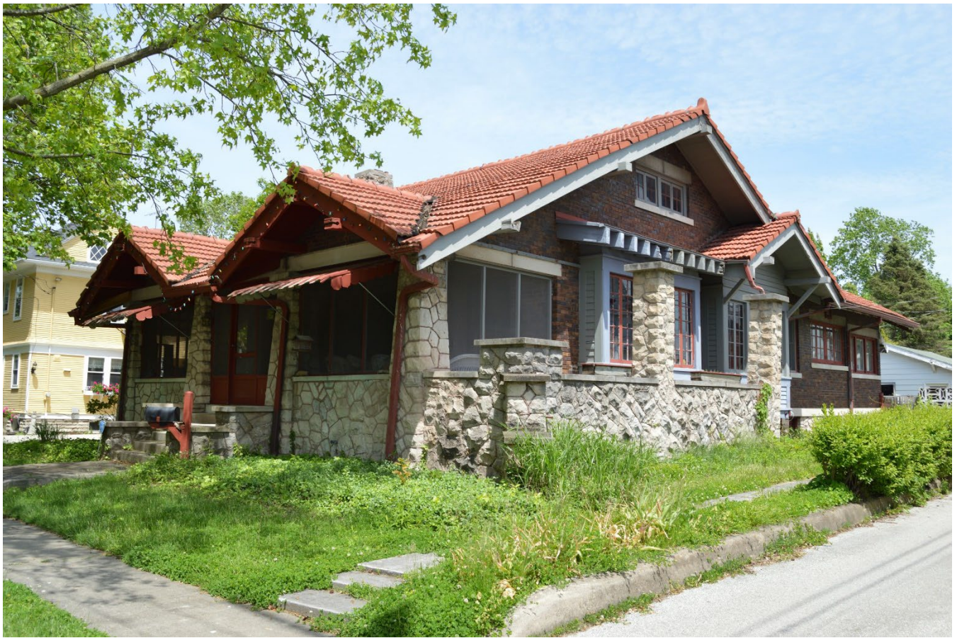
IN_Lawrence County_Bedford Northside Residential Historic District_0026