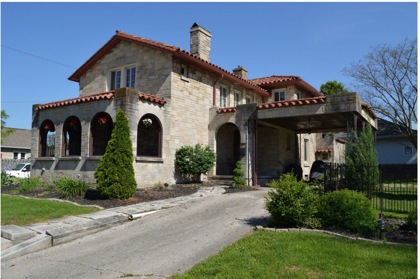
IN_Lawrence County_Bedford Northside Residential Historic District_0022