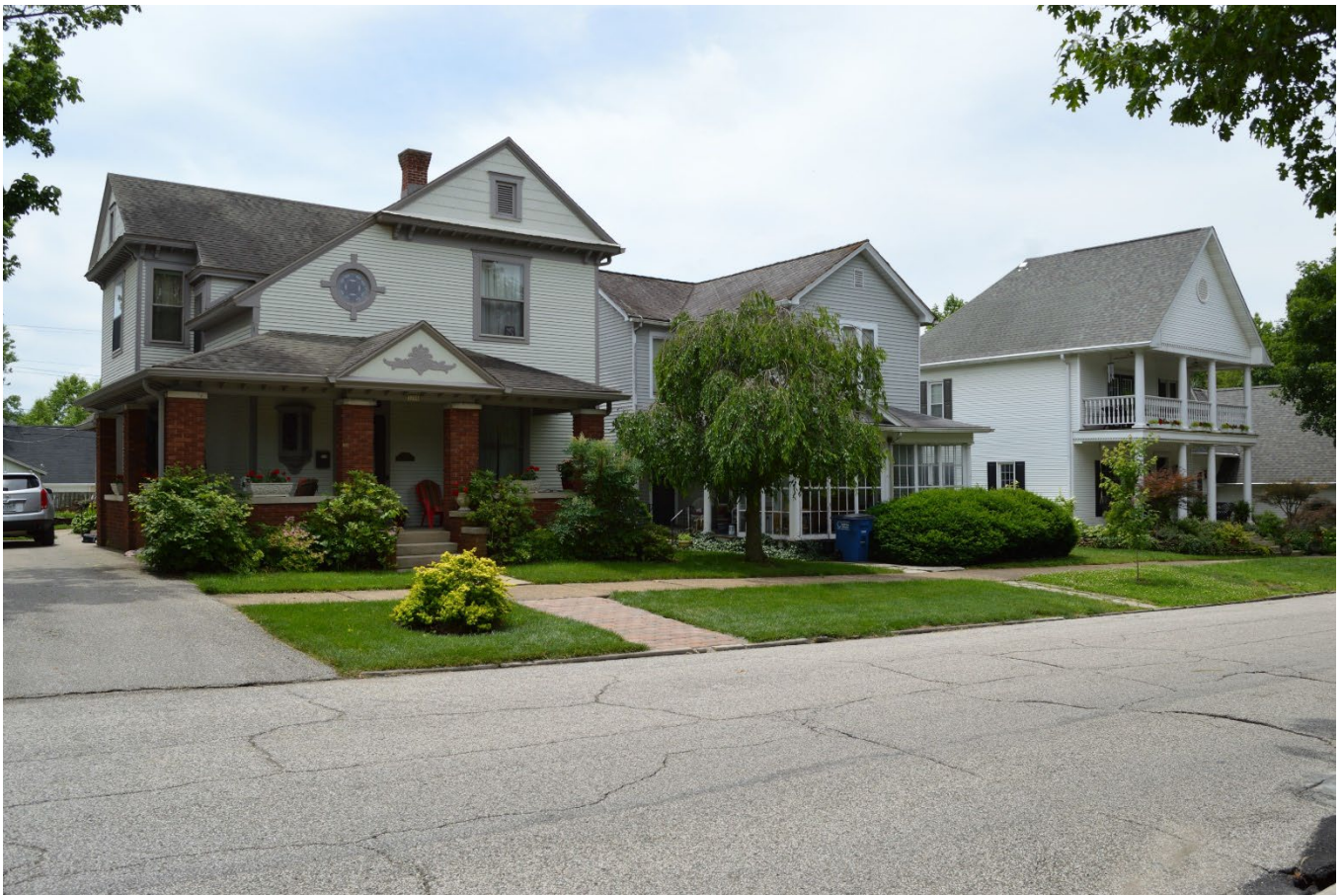
IN_Lawrence County_Bedford Northside Residential Historic District_0001