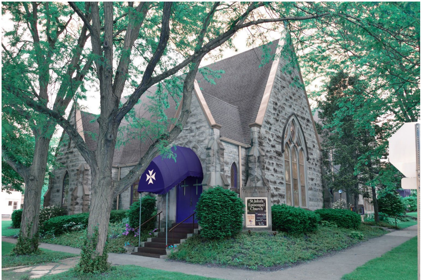
IN_Lawrence County_Bedford Northside Residential Historic District_0003