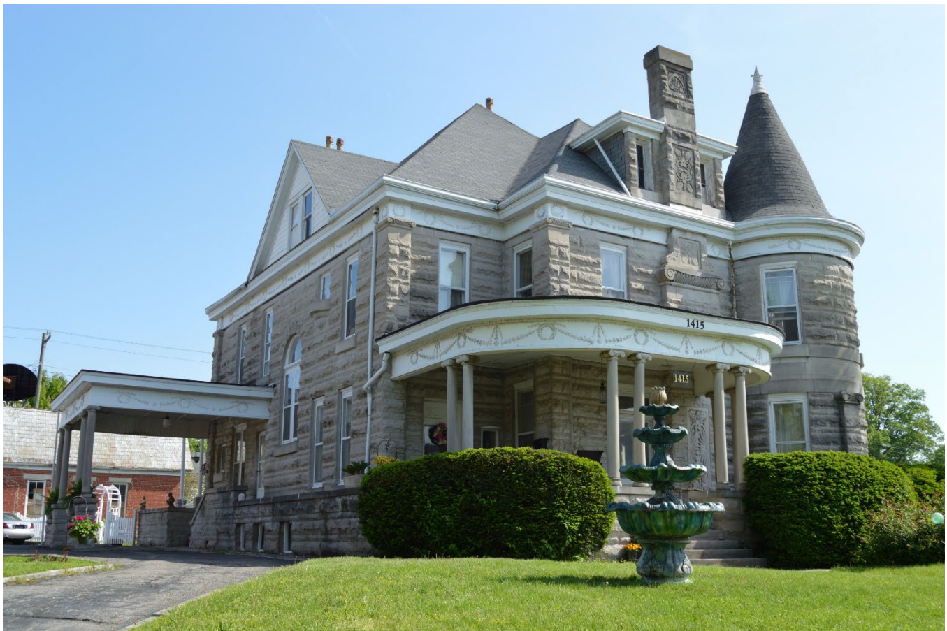
IN_Lawrence County_Bedford Northside Residential Historic District_0033