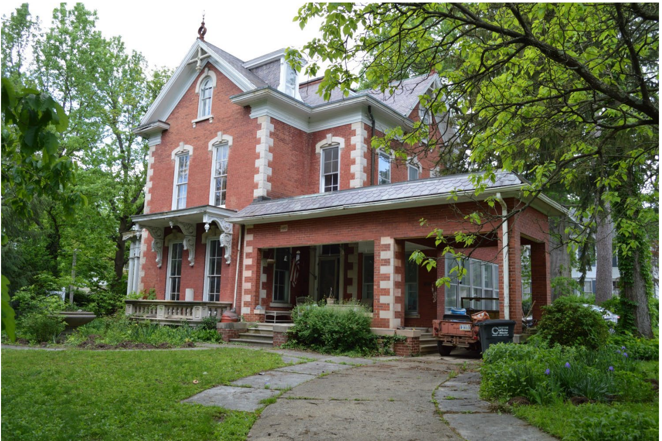
IN_Lawrence County_Bedford Northside Residential Historic District_0046