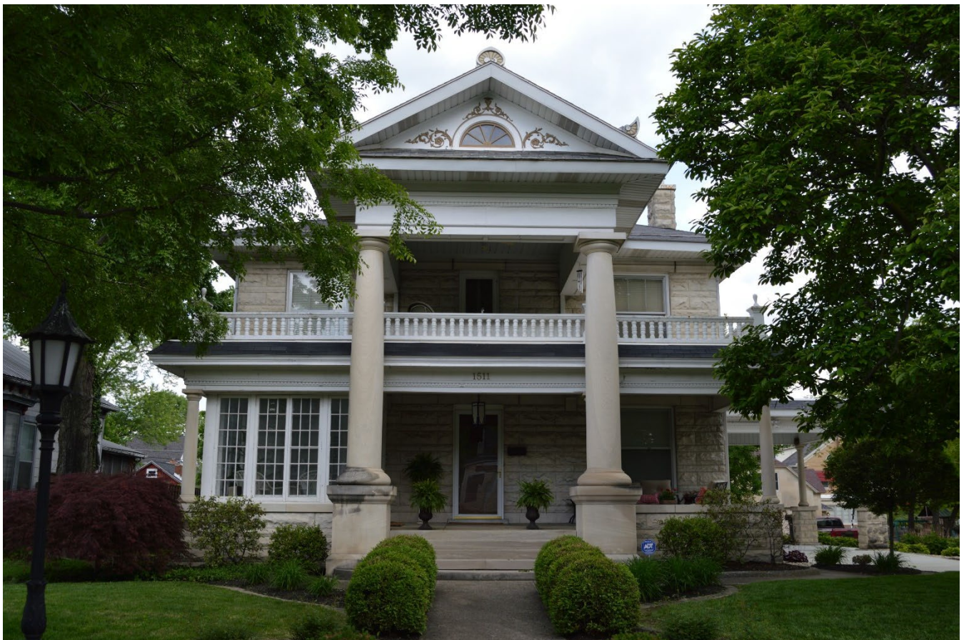
IN_Lawrence County_Bedford Northside Residential Historic District_0017