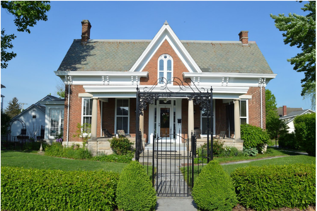
IN_Lawrence County_Bedford Northside Residential Historic District_0048