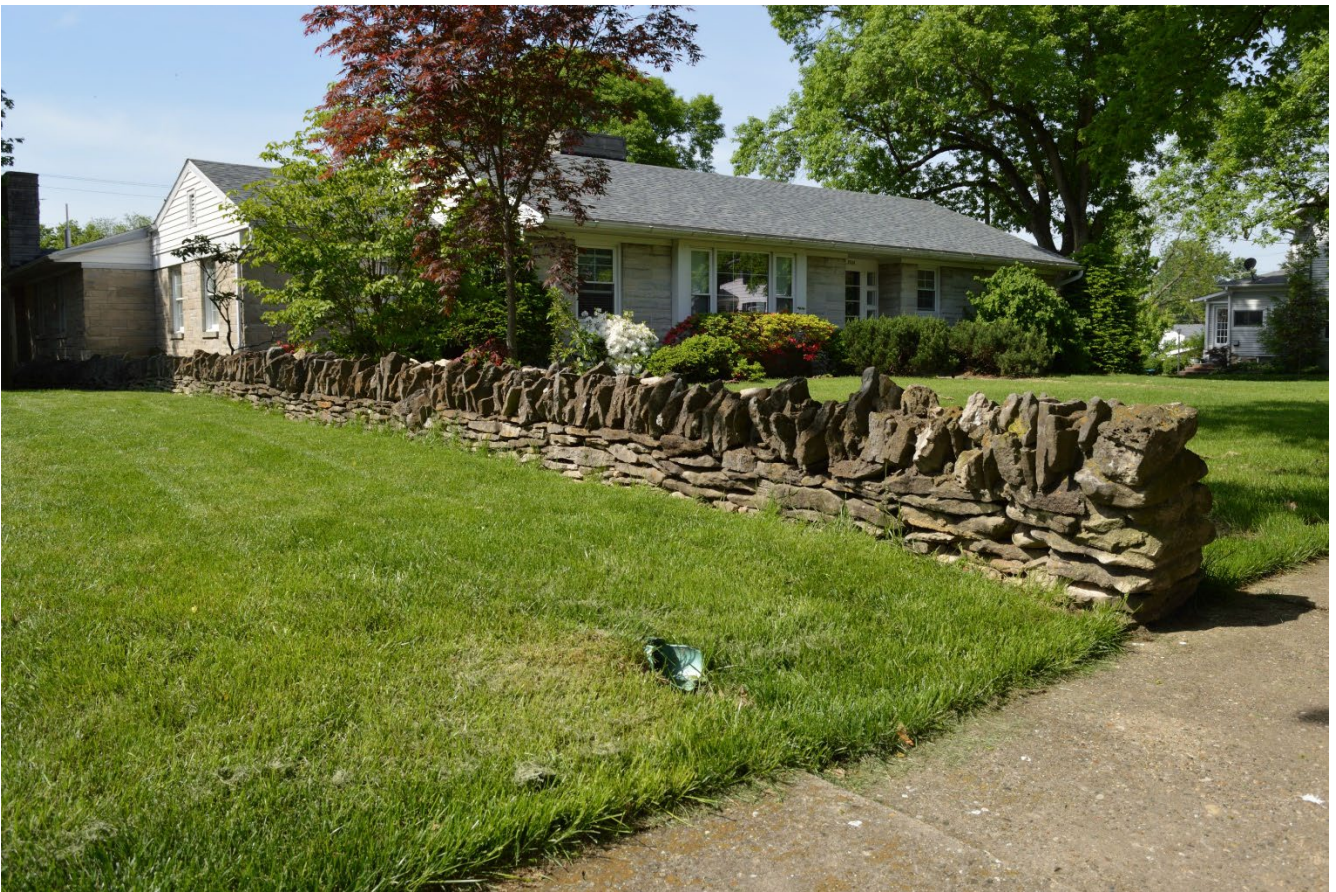
IN_Lawrence County_Bedford Northside Residential Historic District_0019