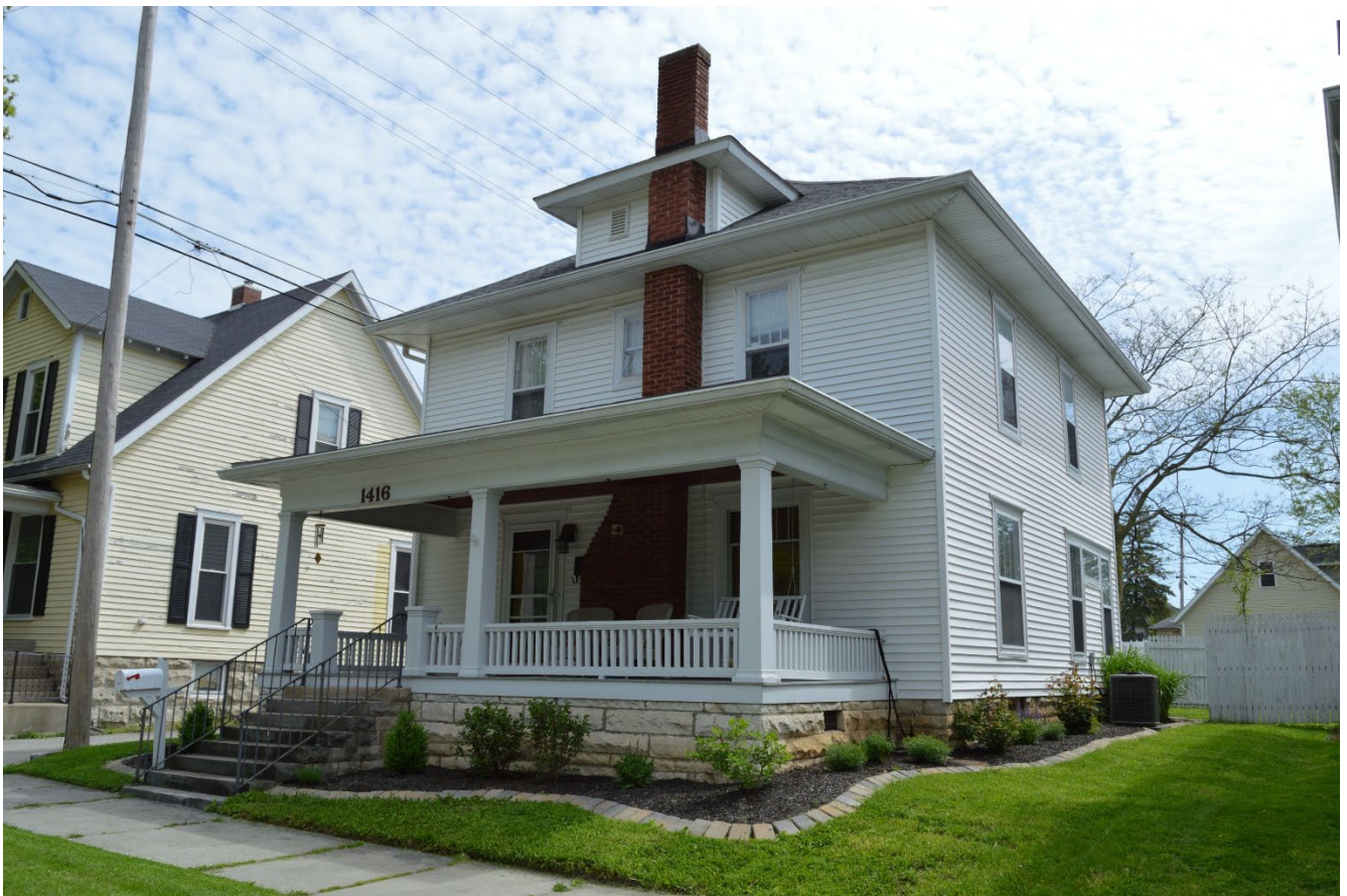
IN_Lawrence County_Bedford Northside Residential Historic District_0043