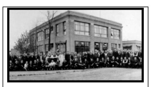
Historic photo of the former Allison Plant 1, in the Speedway Historic District, Marion County.

You will be fortunate if you find historic images of your building. Some common historic structures were photographed by family members or owners; those images may have been discarded or remain unidentified in private collections. Many were simply never captured by an artist or photographer. In some cases, images that have survived at public archives are due to conscientious family members who passed the images on for later use. It is worth your time to attempt to locate old photos or drawings, especially if