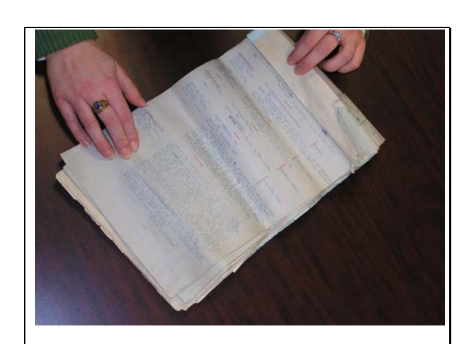
...unroll the abstract and it looks like this..

Tax assessments – note improvements made to the property and their value.