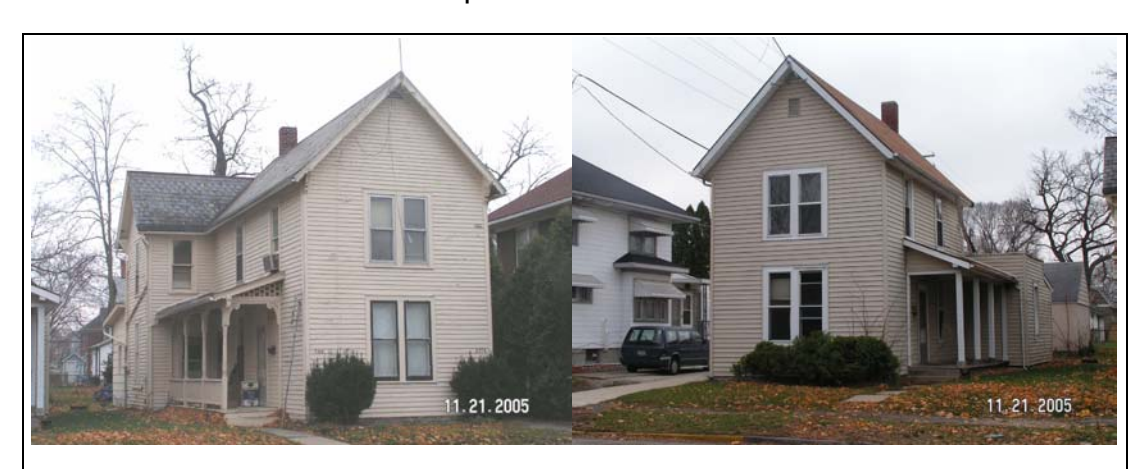
Look at your surroundings, often a neighboring building reveals clues to your building's character. These two houses in the Drover Town Historic District, Huntington, Indiana, were likely very similar at one point. The house at left would assess at a higher value due to the wing.

From 1915 to 1932, most Indiana counties maintained overlapping four year books, effectively covering three years in each book. From 1932 until 1950, transfer books were erratically kept. Currently, transfer books tend to be rewritten at each reassessment of property (last in 1968) or ten year intervals. By running the names of any owner back through the various transfers to 1840, the provenance of most Indiana structures can be determined with precision.