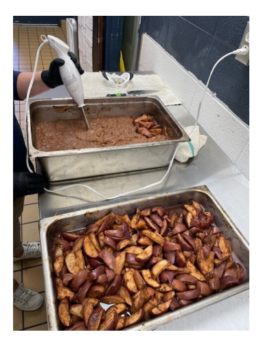
St. Mary Cathedral School in Lafayette partnered with Purdue Extension for Apple Crunch Day. Students from kindergarten to fourth grade learned about different types of apples and the purpose of all the parts of an apple.

Southeast Fountain School Corporation made apple sauce from local apples for their elementary, junior high, and high school! They diced and blended roughly six cases of Red Delicious apples, and visited 10 classrooms to teach about apples and let the kids taste different kinds.