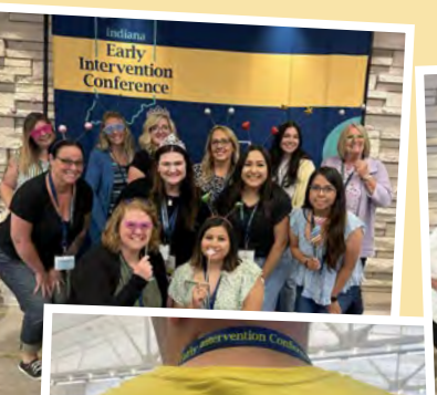
CONTENTS: EXCEPTIONAL FIRST STEPS THERAPIST COMMITTED TO SUPPORTING HODSIER FAMILIES WHOSE YOUNG CHILDREN ARE EXPERIENCING DEVELOPMENTAL DELAYS AND CONNECTING THEM WITH THEIR POTENTIAL. MAY ALSO CONTAIN CAFFEINE.